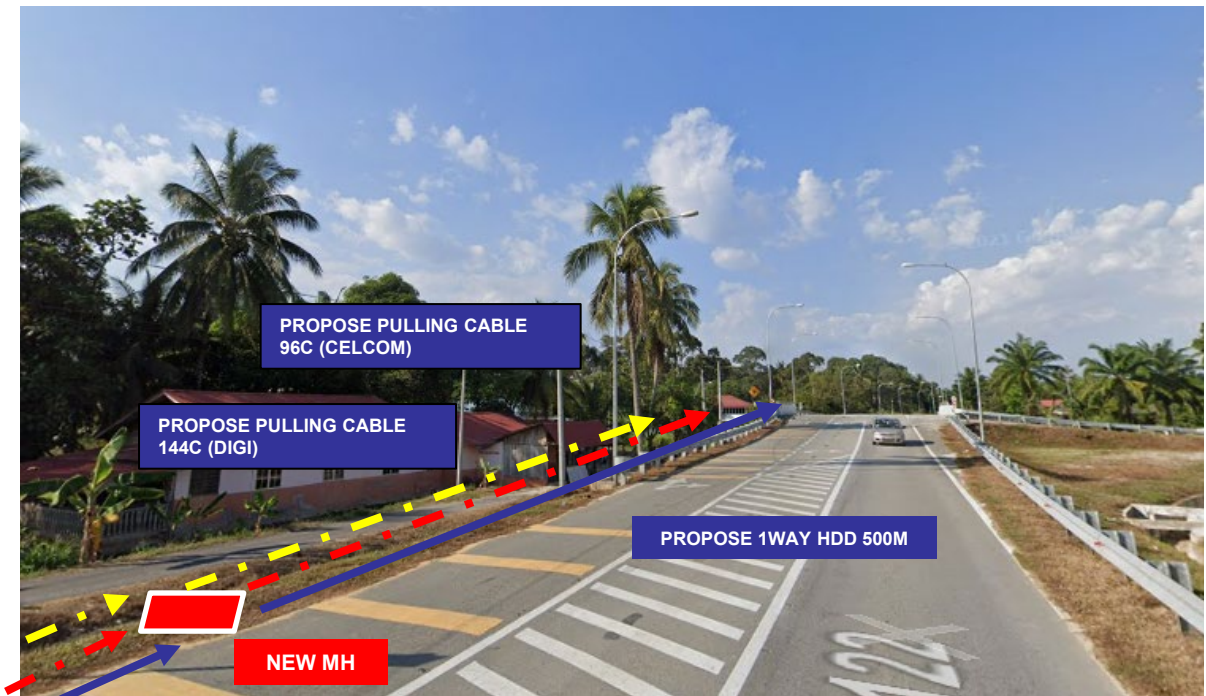
JALAN CHIKUS SUNGAI MANIK PERAK