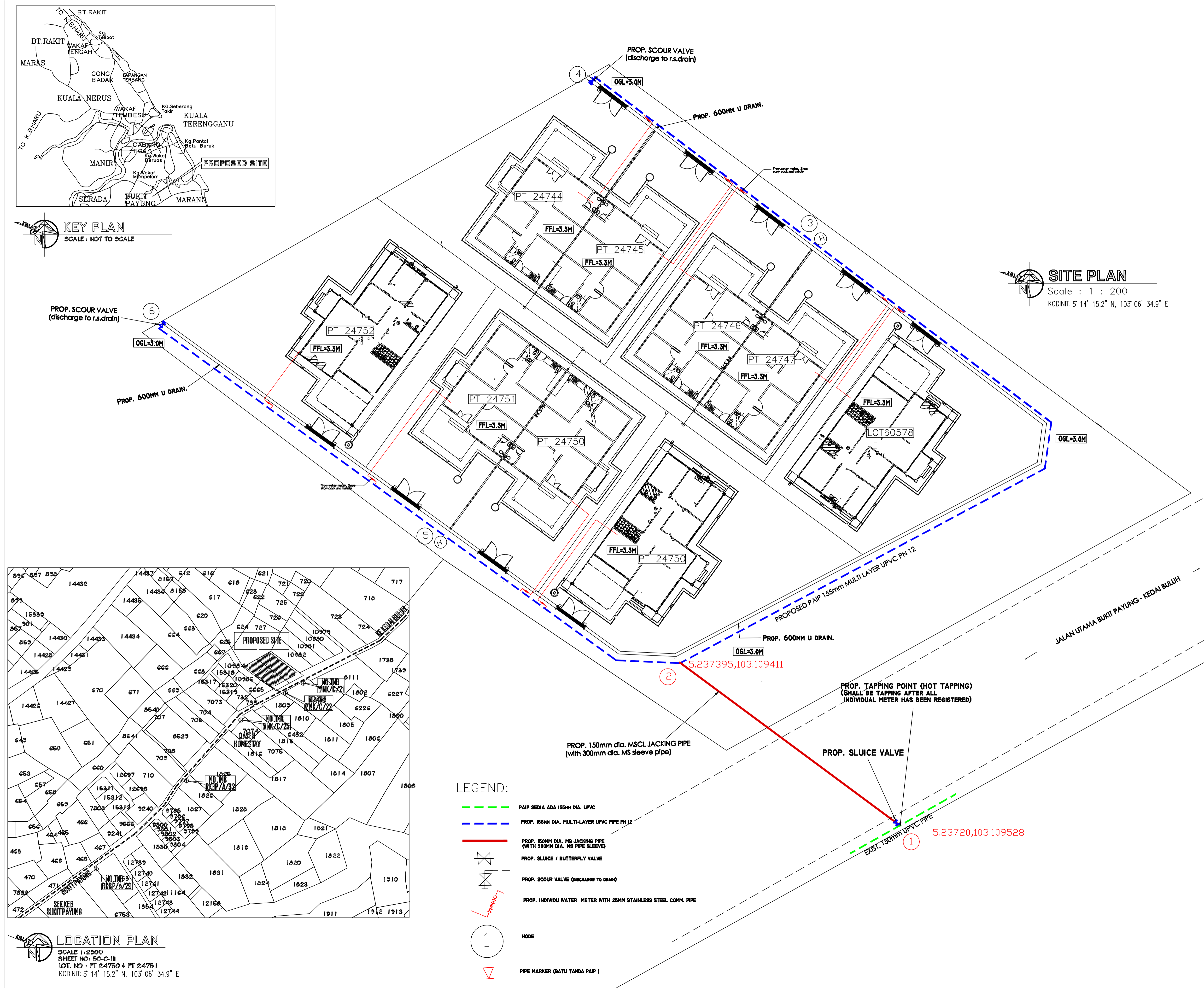
SITE PLAN Scale : 1 : 200 KODINIT: 5° 14' 15.2" N, 103° 06' 34.9" E