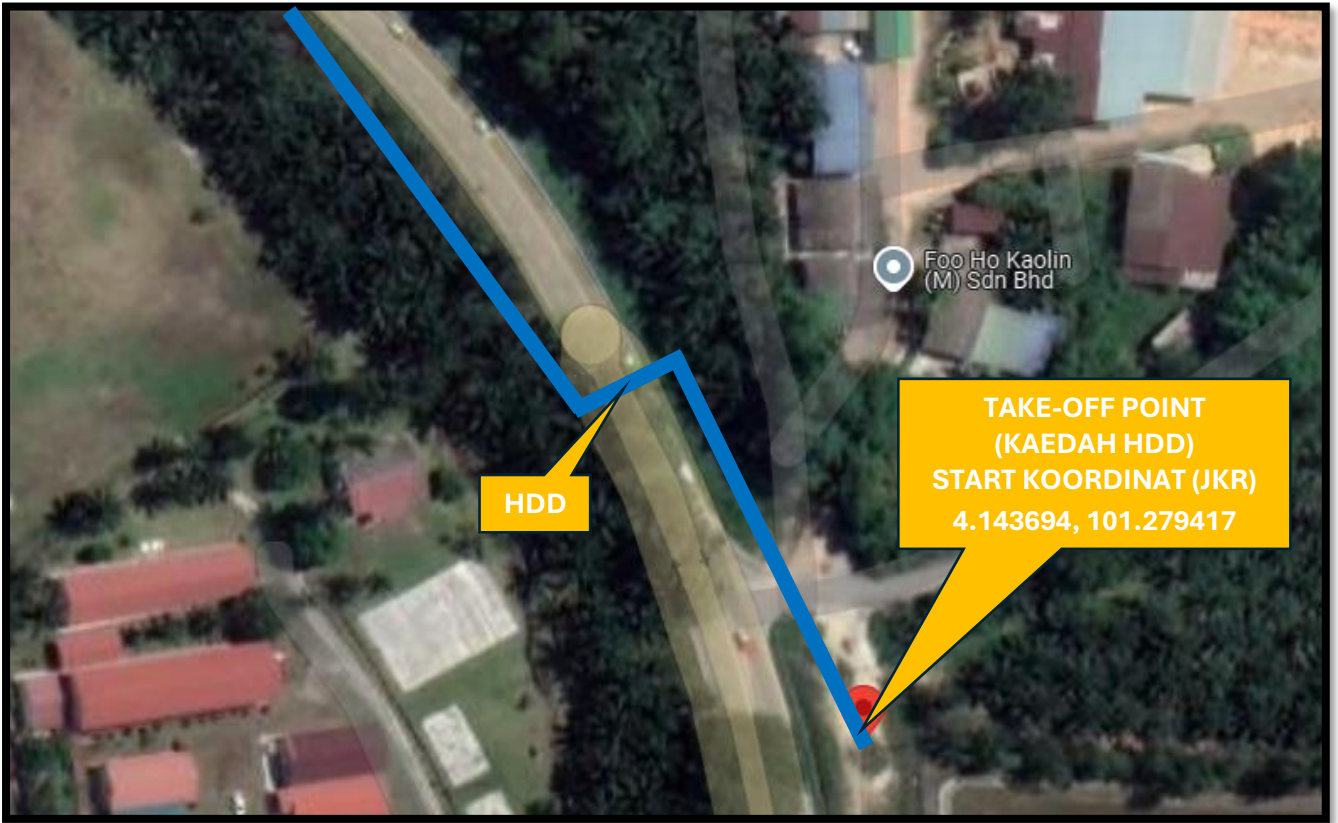
FIGURE 1.1: JALAN IPOH – KUALA LUMPUR (1)