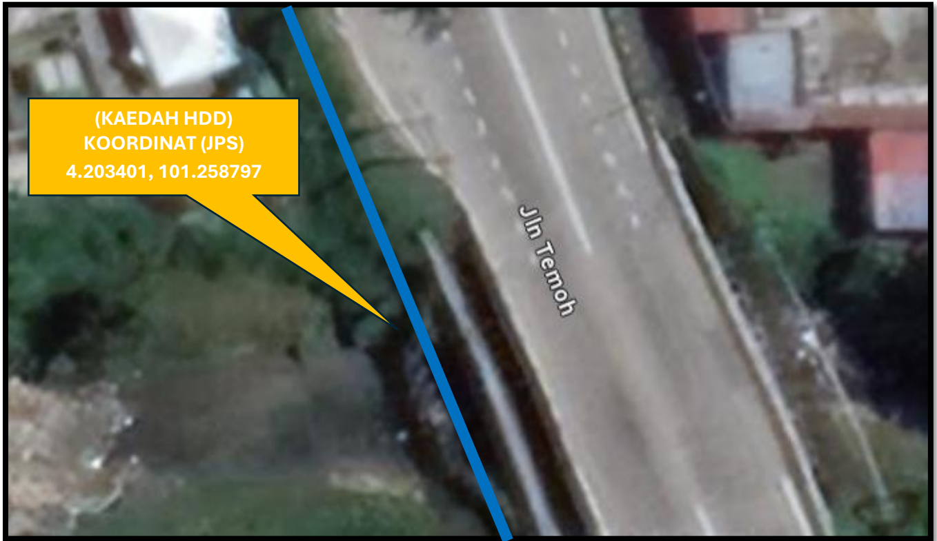
FIGURE 1.14: JALAN IPOH – KUALA LUMPUR (1)