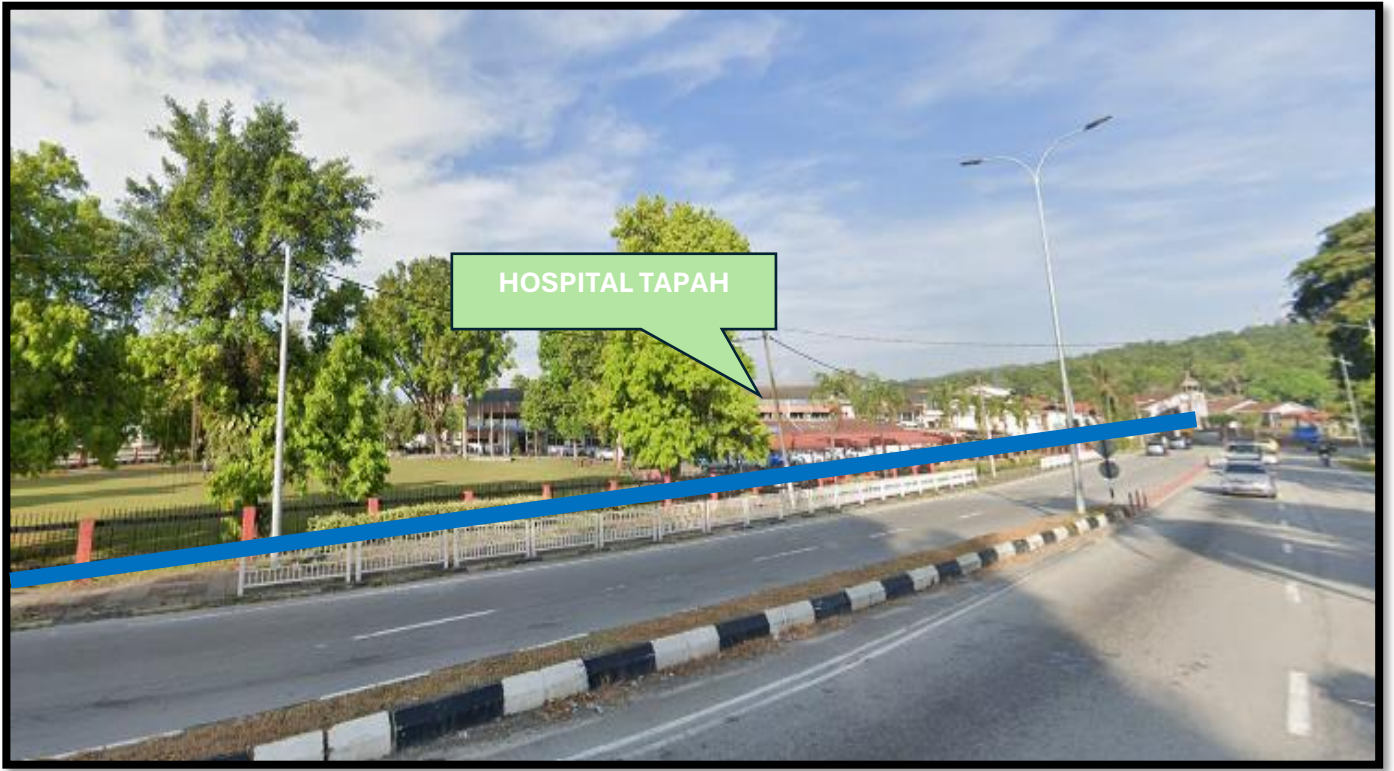
FIGURE 1.13: JALAN IPOH – KUALA LUMPUR (1)