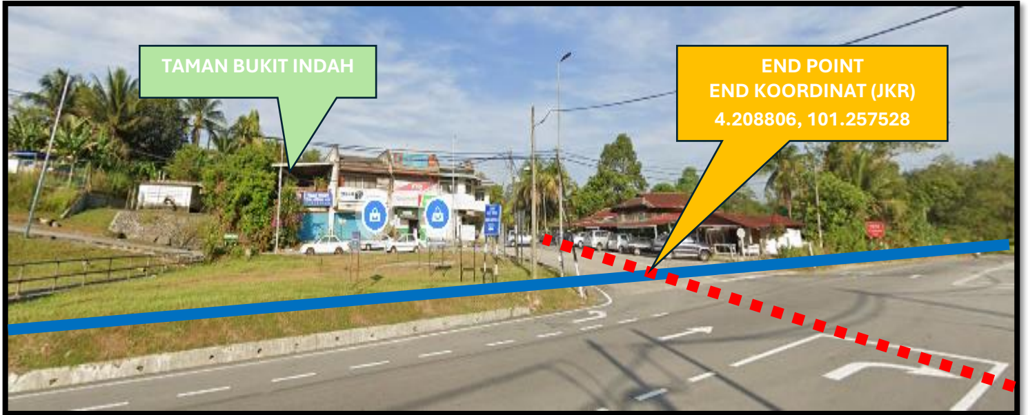
FIGURE 1.16: JALAN IPOH – KUALA LUMPUR (1)