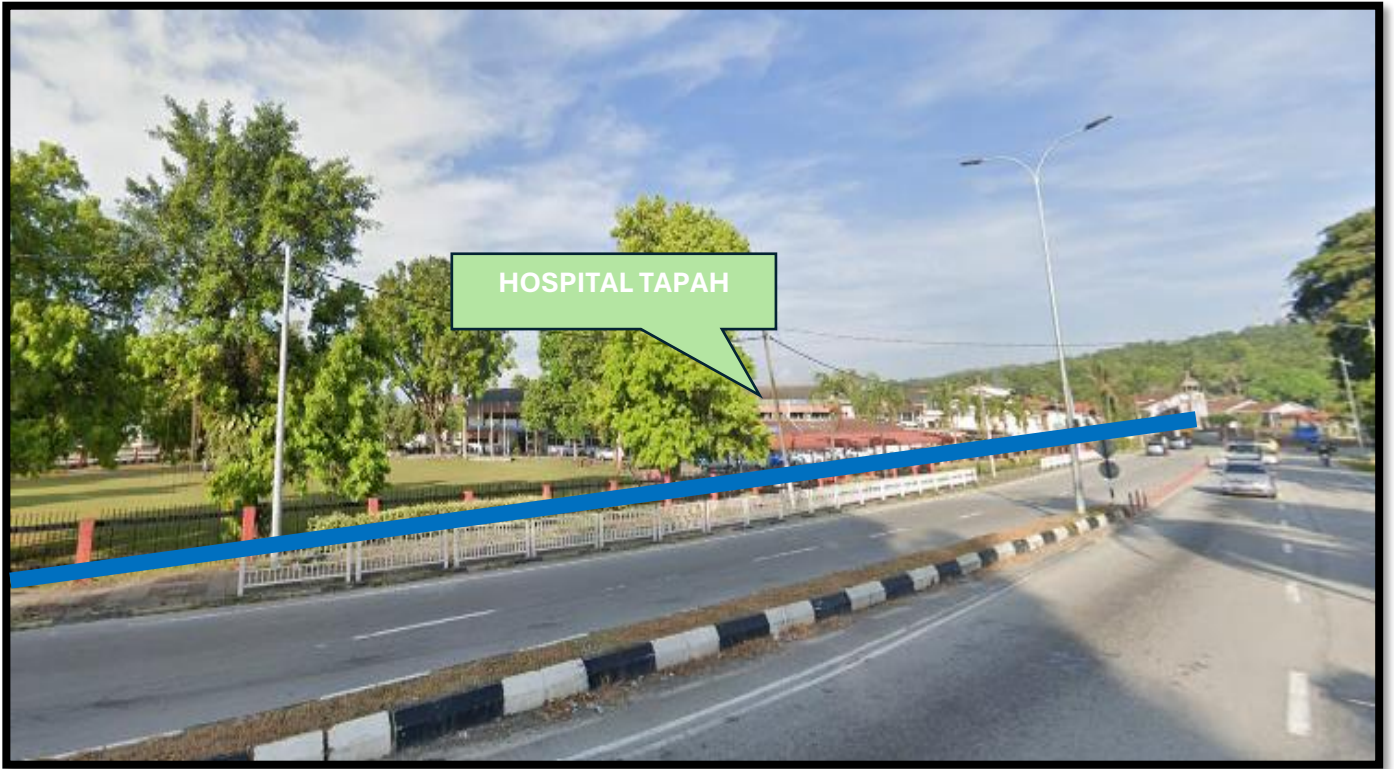
FIGURE 1.13: JALAN IPOH – KUALA LUMPUR (1)