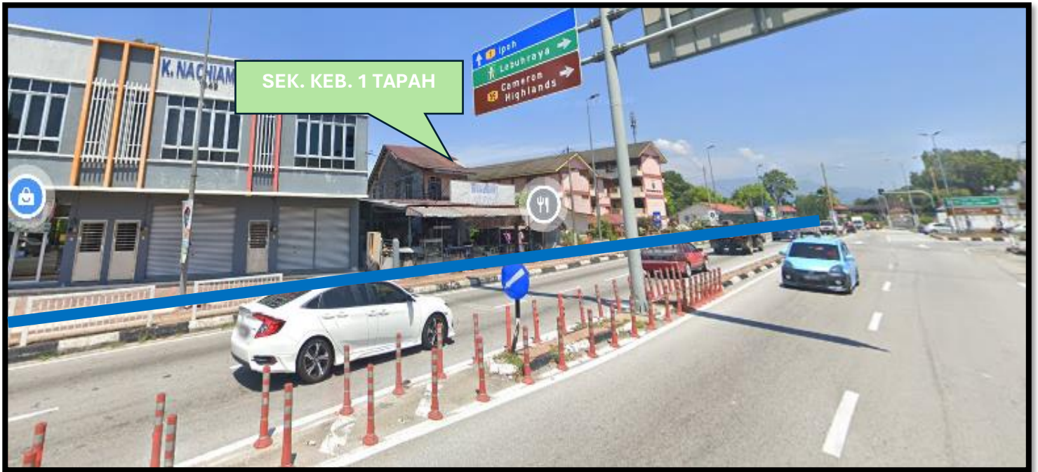
FIGURE 1.12: JALAN IPOH – KUALA LUMPUR (1)