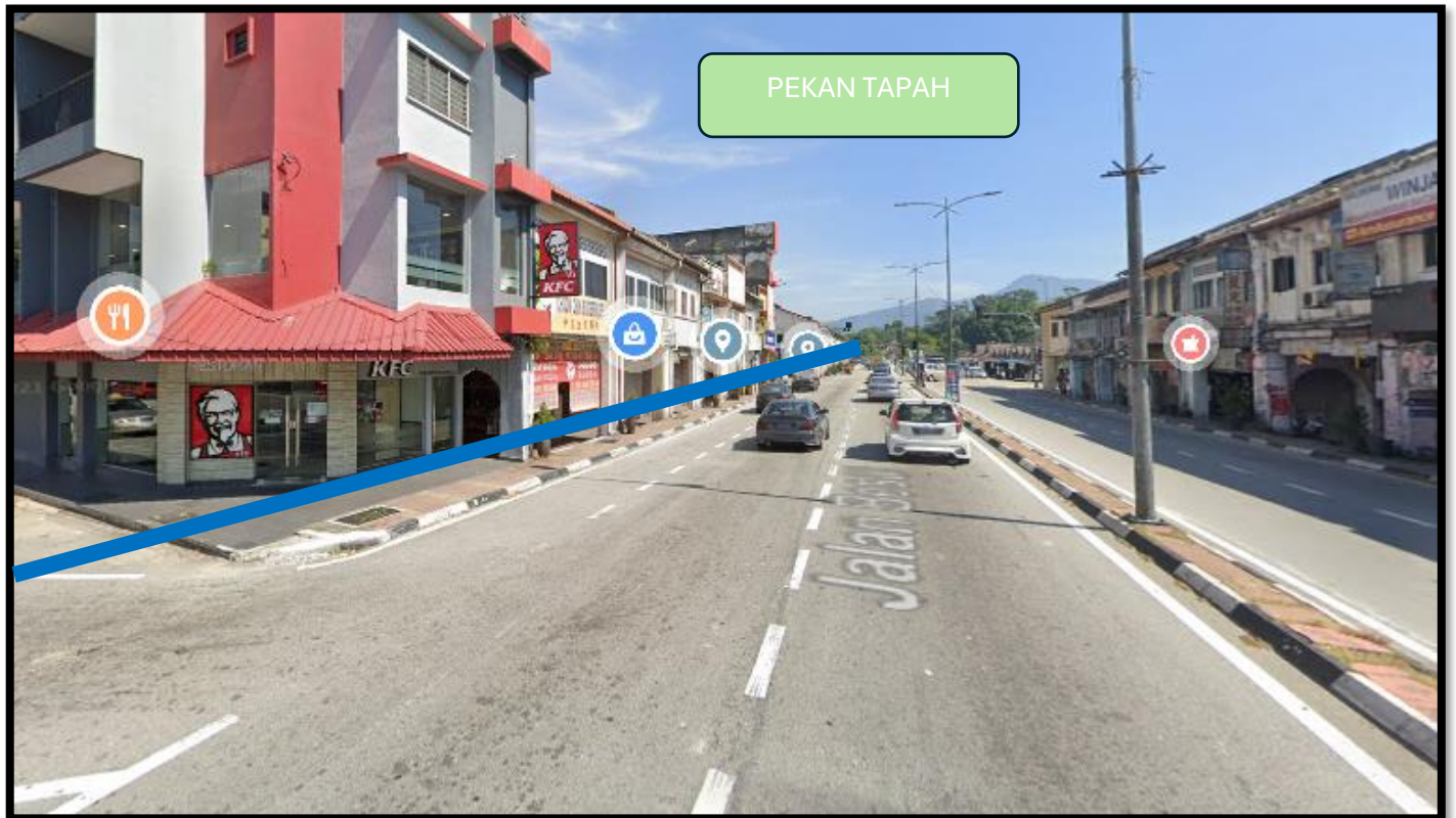
FIGURE 1.10: JALAN IPOH – KUALA LUMPUR (1)