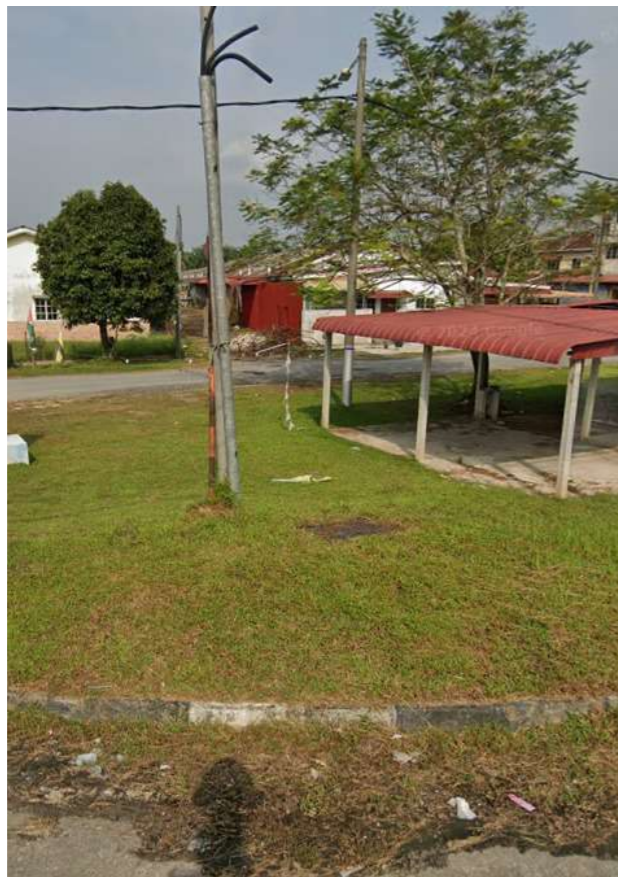
LOKASI MANHOLE 4.86995657, 100.68417475