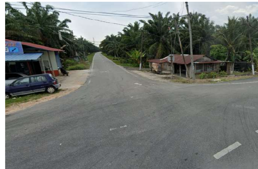
25m OPEN CUT PREMIX