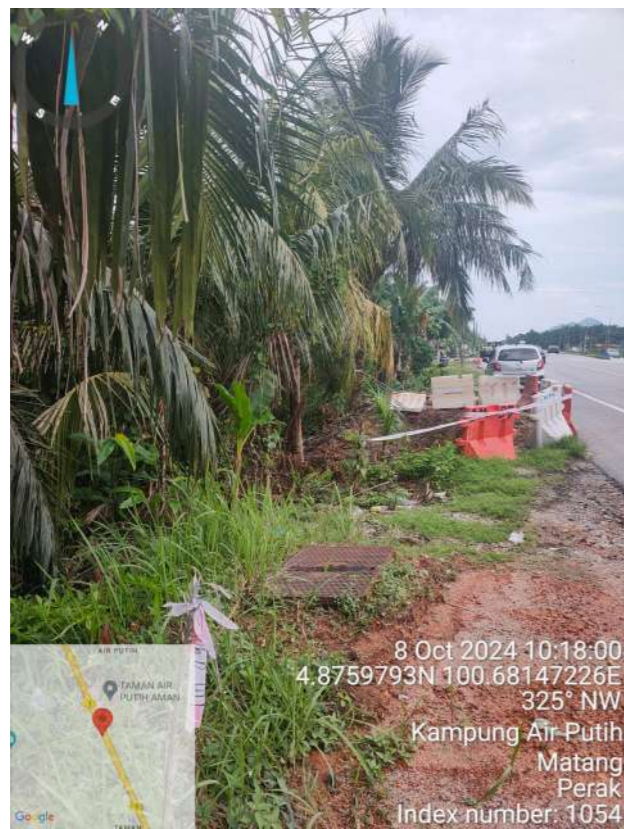
LOKASI MANHOLE 4.87665017, 100.68108952