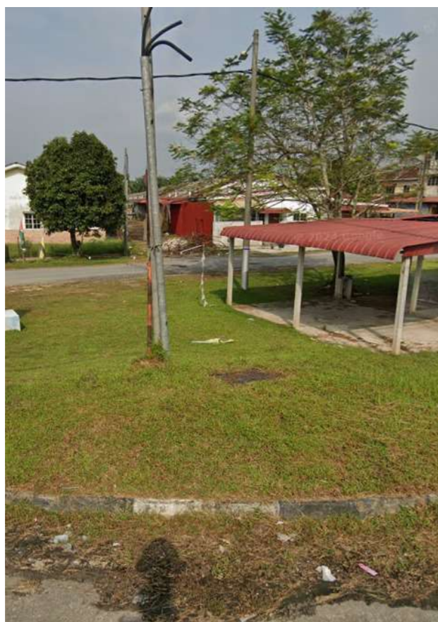
LOKASI MANHOLE 4.86995657, 100.68417475