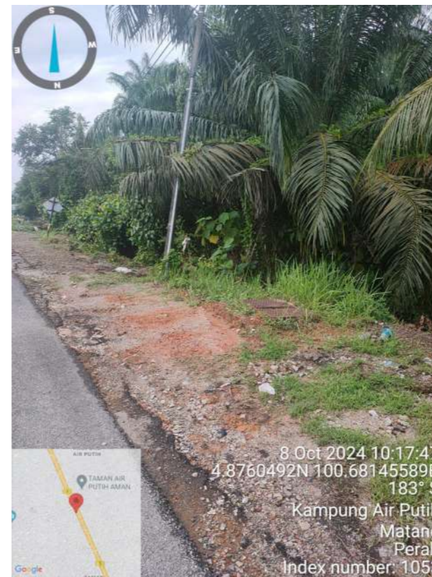
70m TRENCHING ON GRASS