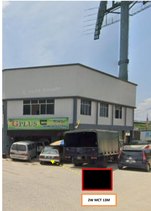
REDMARK: MCT DARIPADA PROPOSED NEW MH KE BANGUNAN BENGKEL KERETA G PLUS