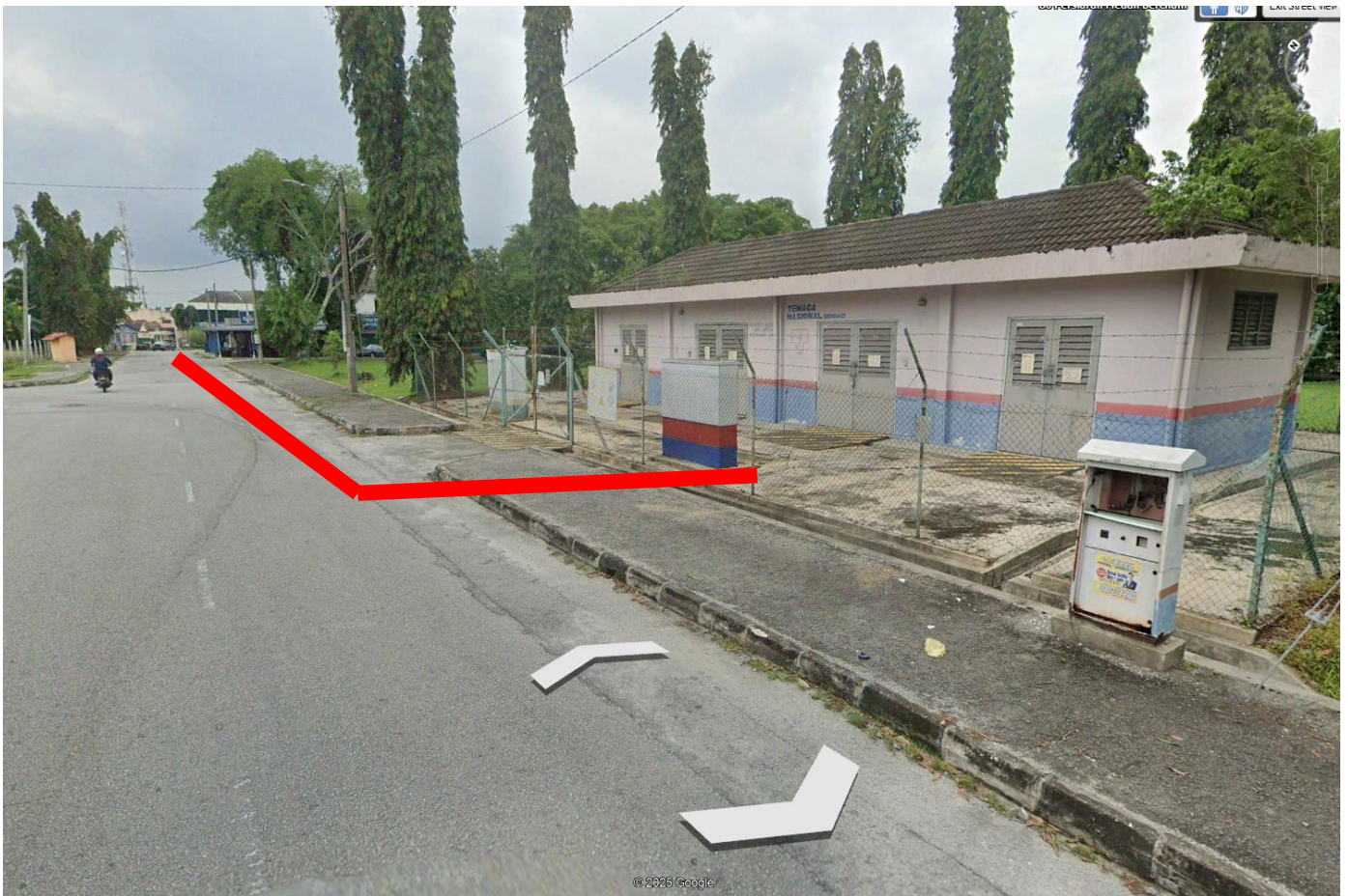
PERSIARAN MEDAN BERCHAM (140m)