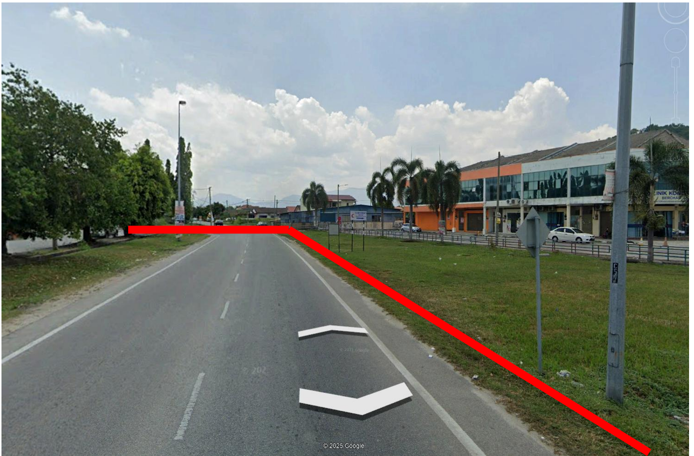
PERSIARAN BERCHAM TIMUR 10 (160m)