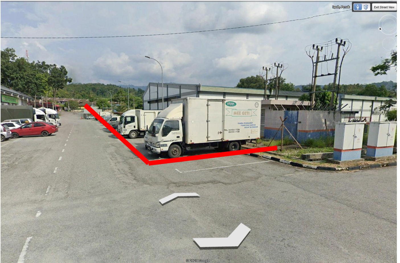
MARA HALAL INDUSTRI PARK (80m)