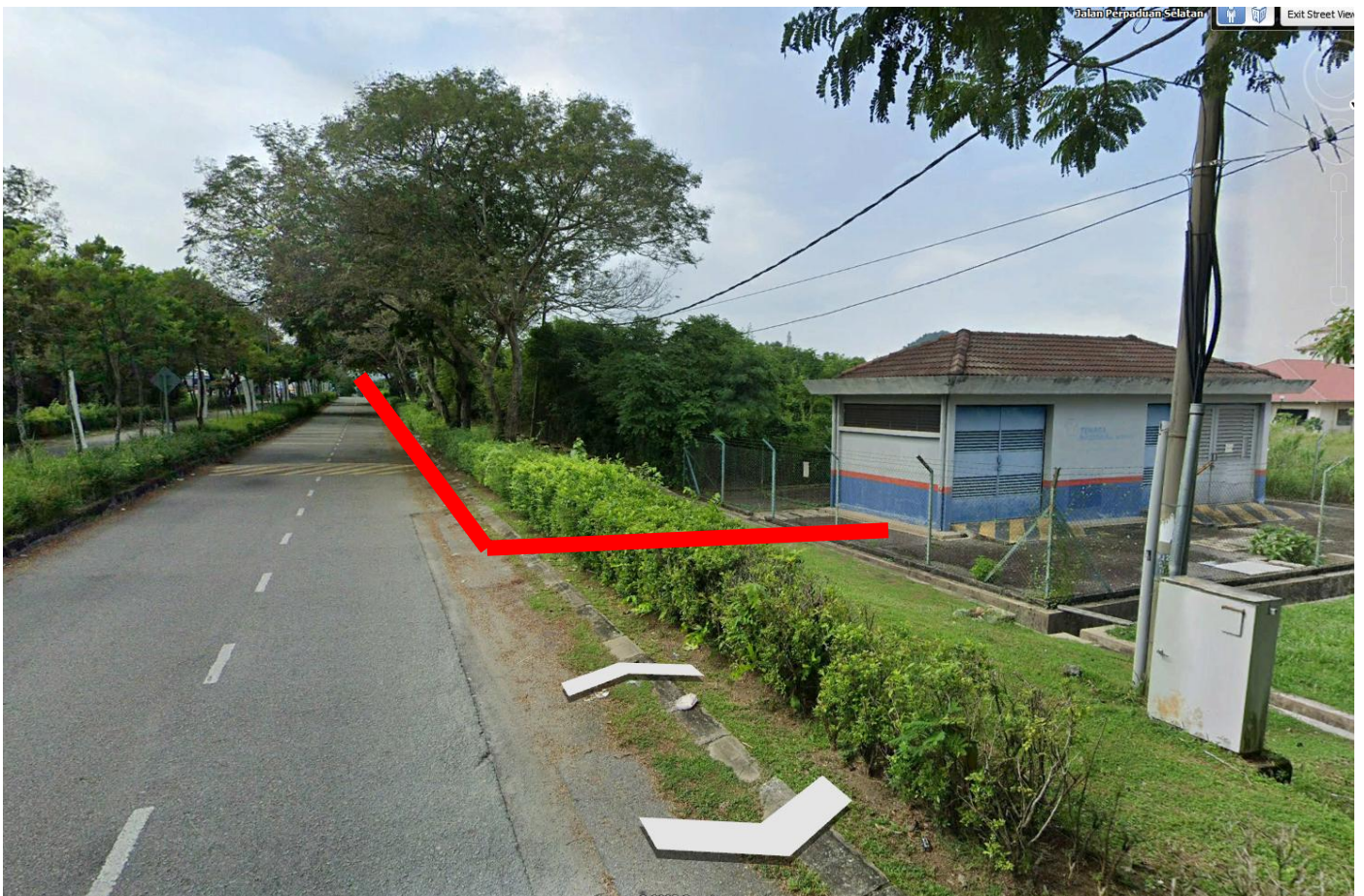
JALAN PERPADUAN SELATAN (160m)