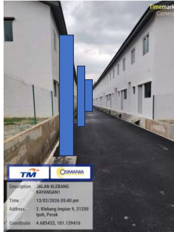
Blkg Rmh Jalan Klebang Kayangan 3