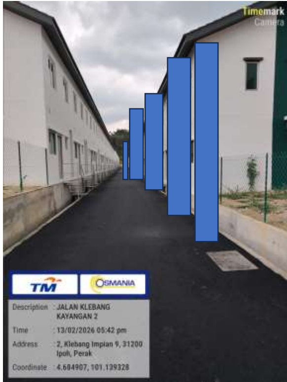
Blkg Rmh Jalan Klebang Kayangan 2