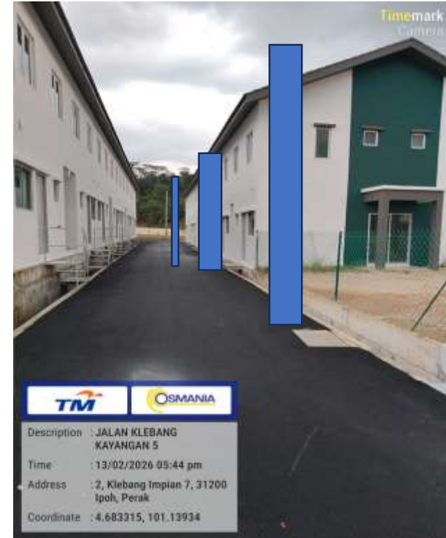
Blkg Rmh Jalan Klebang Kayangan 5