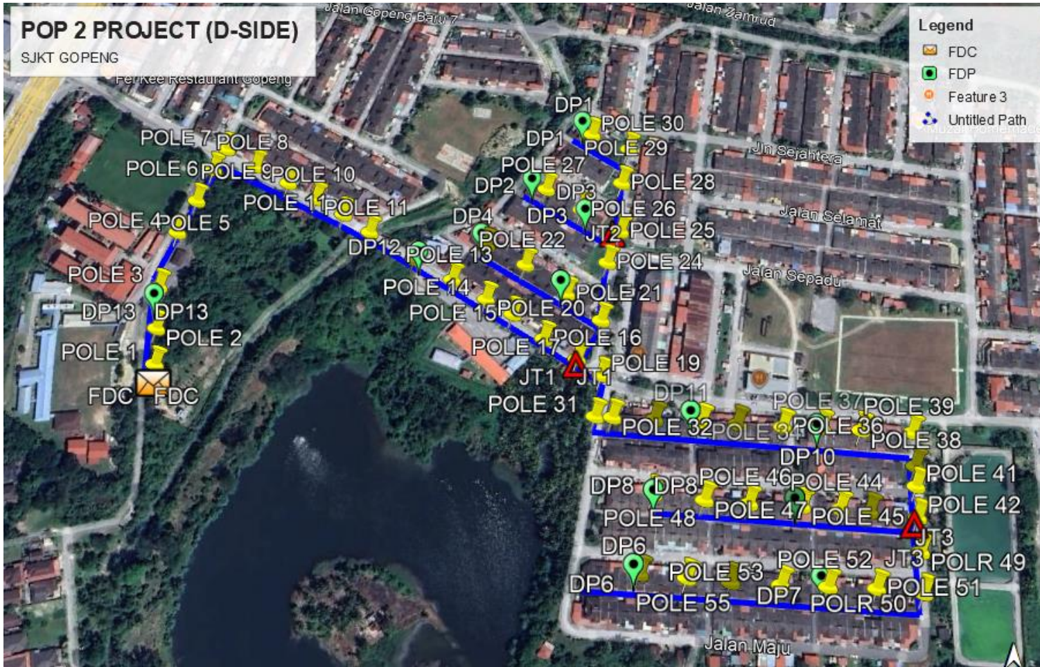
Route Blue Colour – Majlis Daerah Kampar