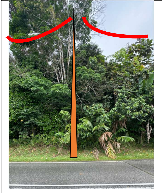
New pole -1 3.774008 , 101.496896