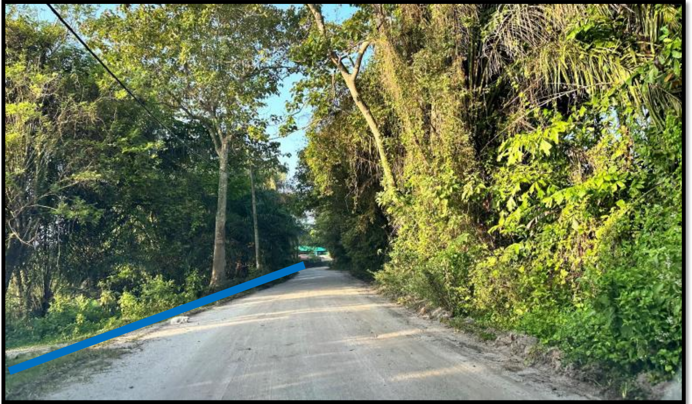
FIGURE 1.7: REZAB JALAN MILIKAN PDT BATANG PADANG