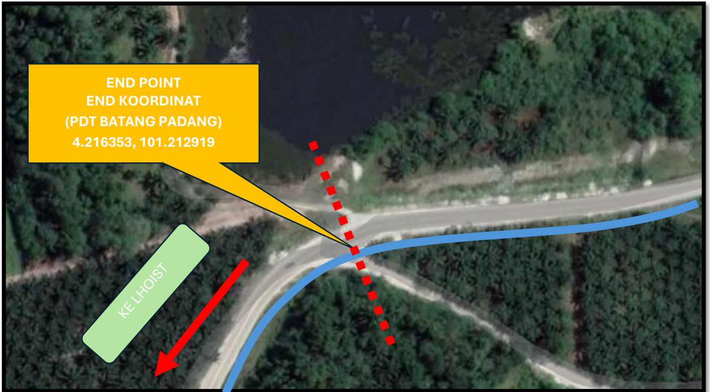
FIGURE 1.8: REZAB JALAN MILIKAN PDT BATANG PADANG