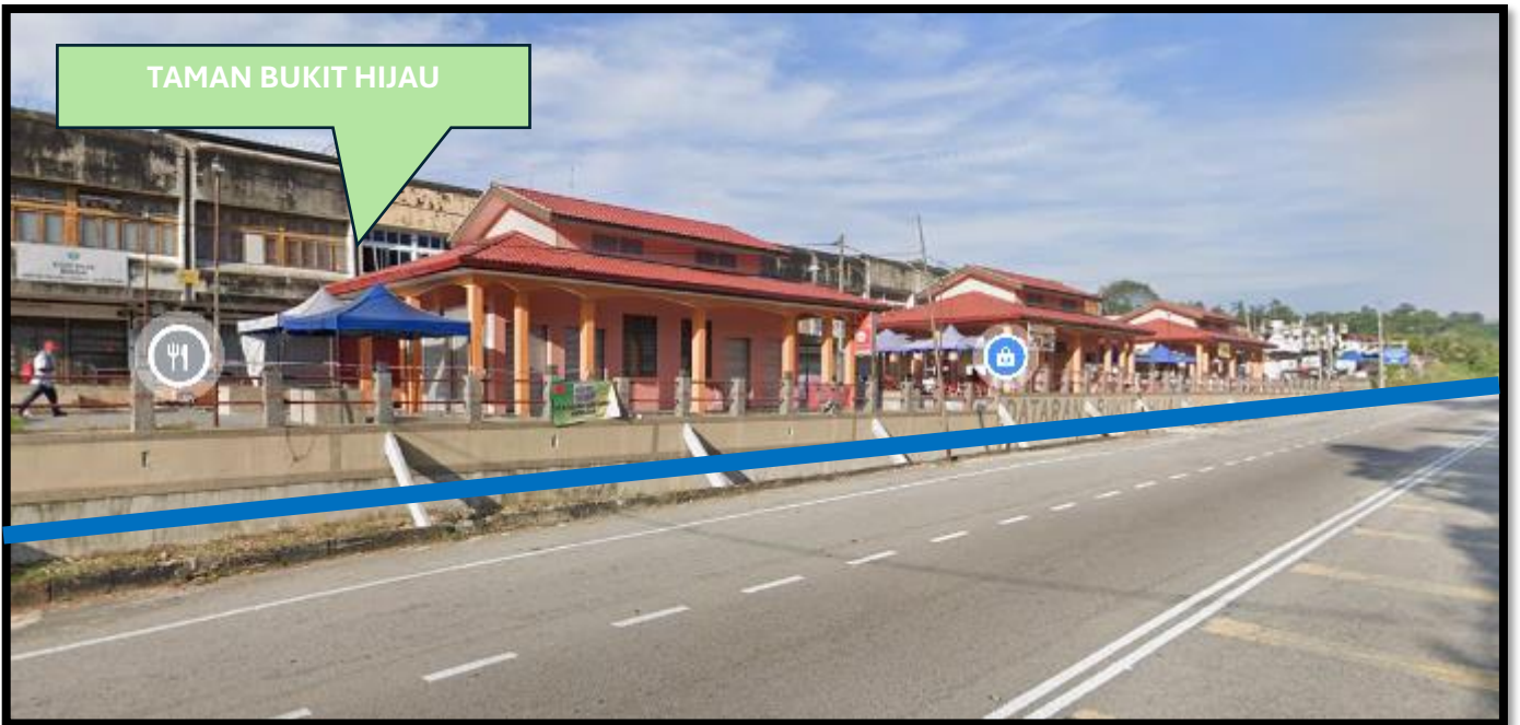
FIGURE 1.2: JALAN IPOH – KUALA LUMPUR (1)