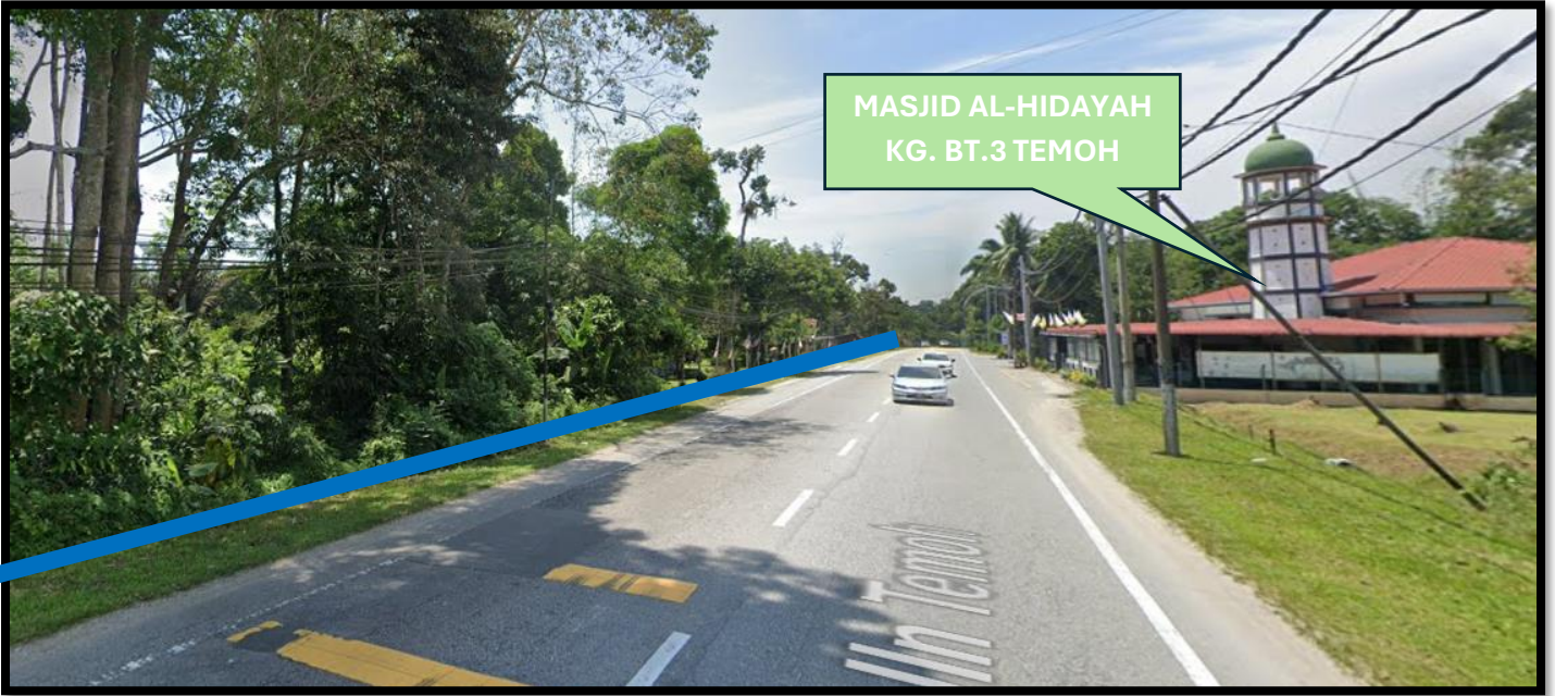
FIGURE 1.5: JALAN IPOH – KUALA LUMPUR (1)