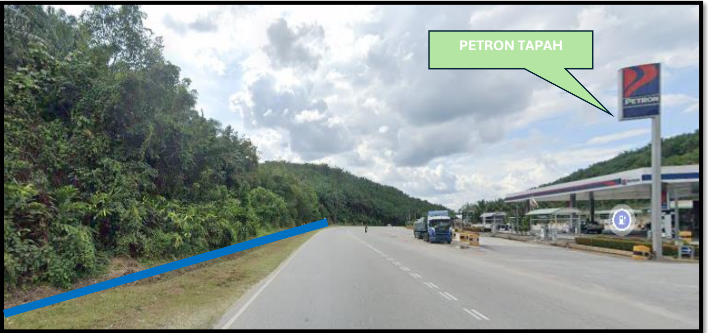
FIGURE 1.3: JALAN IPOH – KUALA LUMPUR (1)