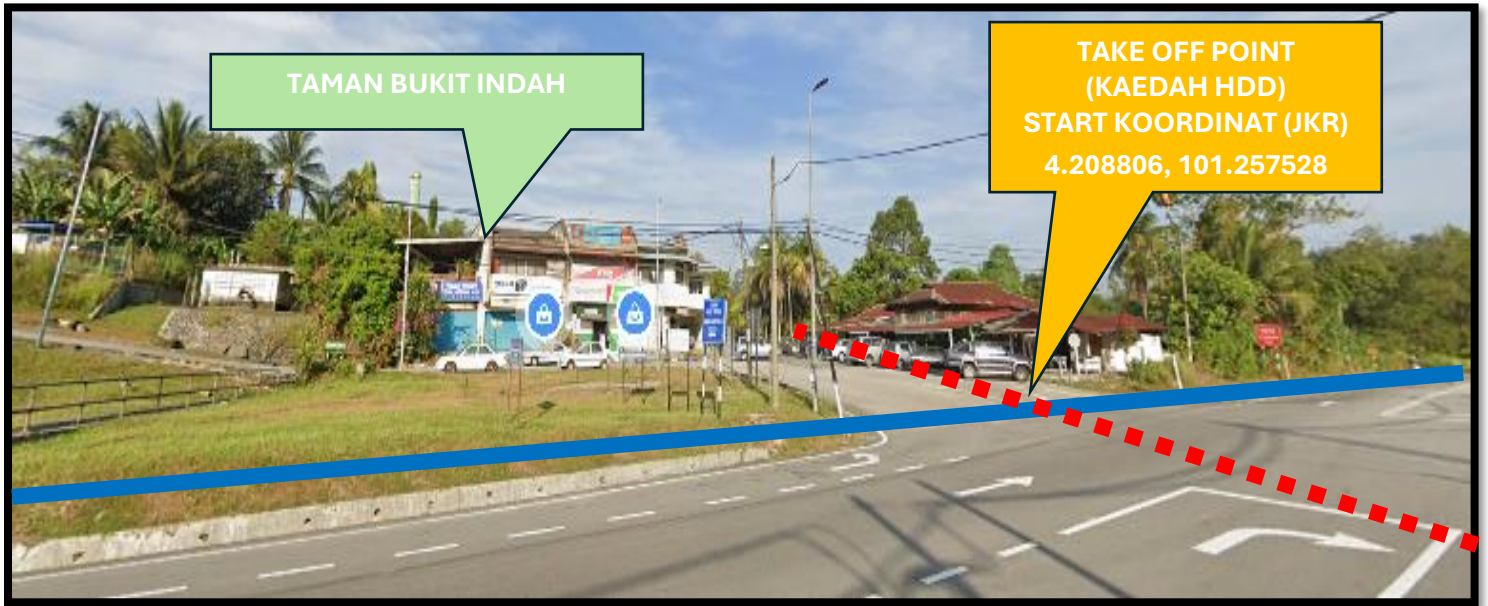
FIGURE 1.1: JALAN IPOH – KUALA LUMPUR (1)