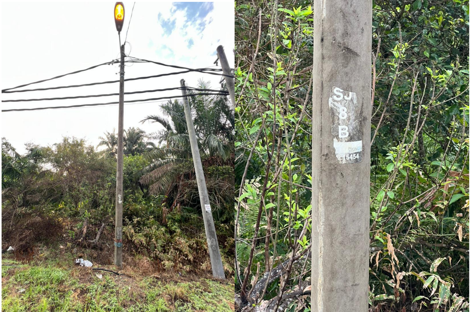
TNB Pole 5.1855565596689, 100.6761967119 *HDD starting point