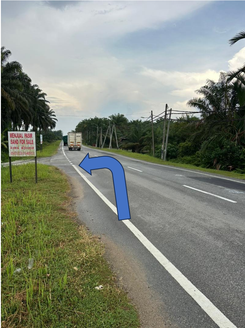
From main road