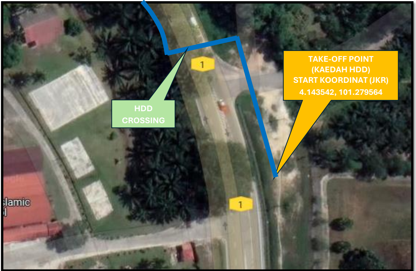
FIGURE 1.1: JALAN IPOH – KUALA LUMPUR (1)