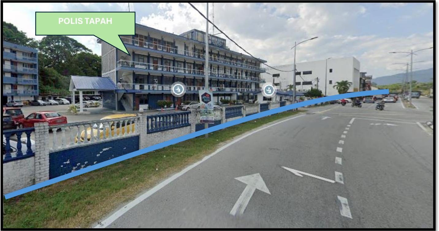
FIGURE 1.8: JALAN IPOH – KUALA LUMPUR (1)