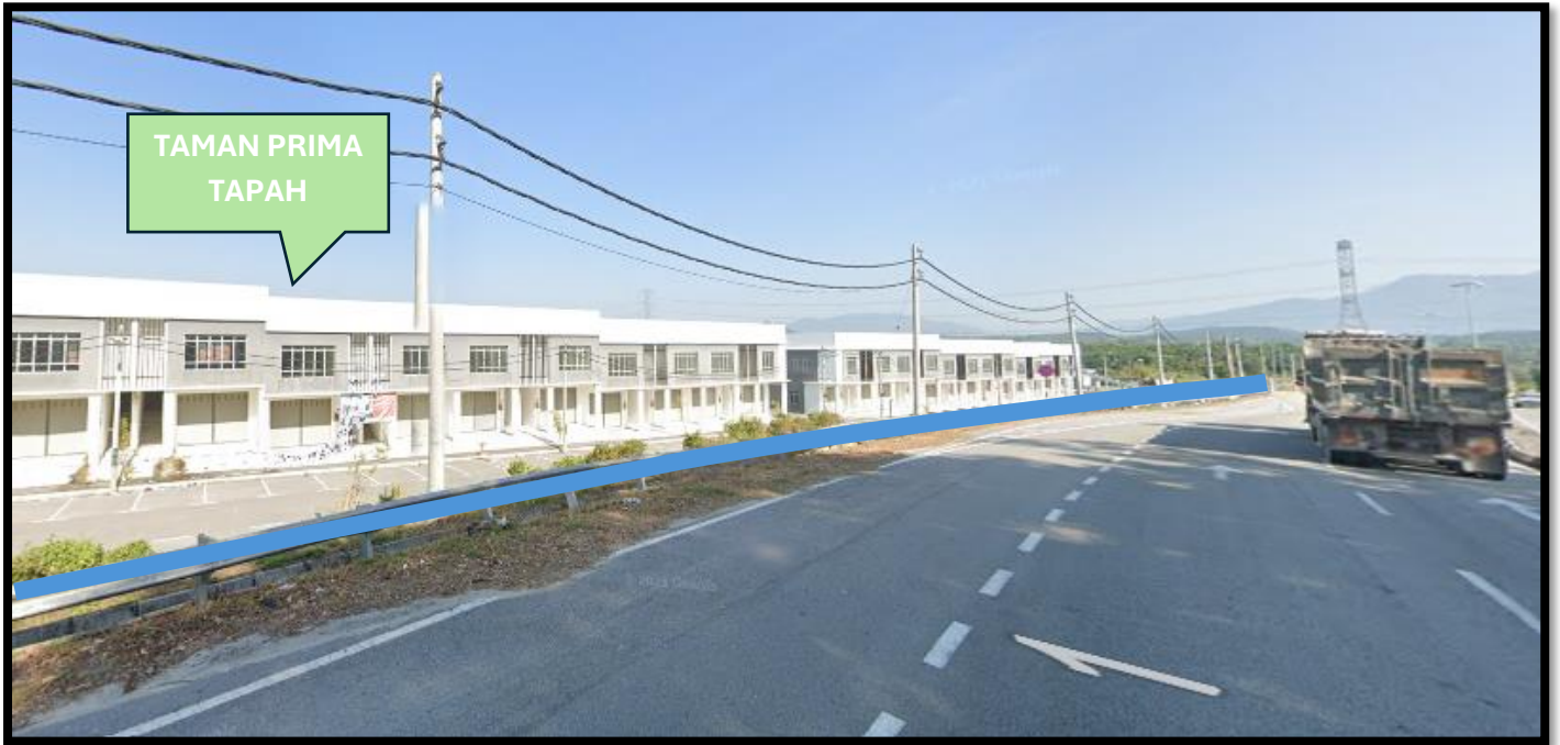
FIGURE 1.2: JALAN IPOH – KUALA LUMPUR (1)