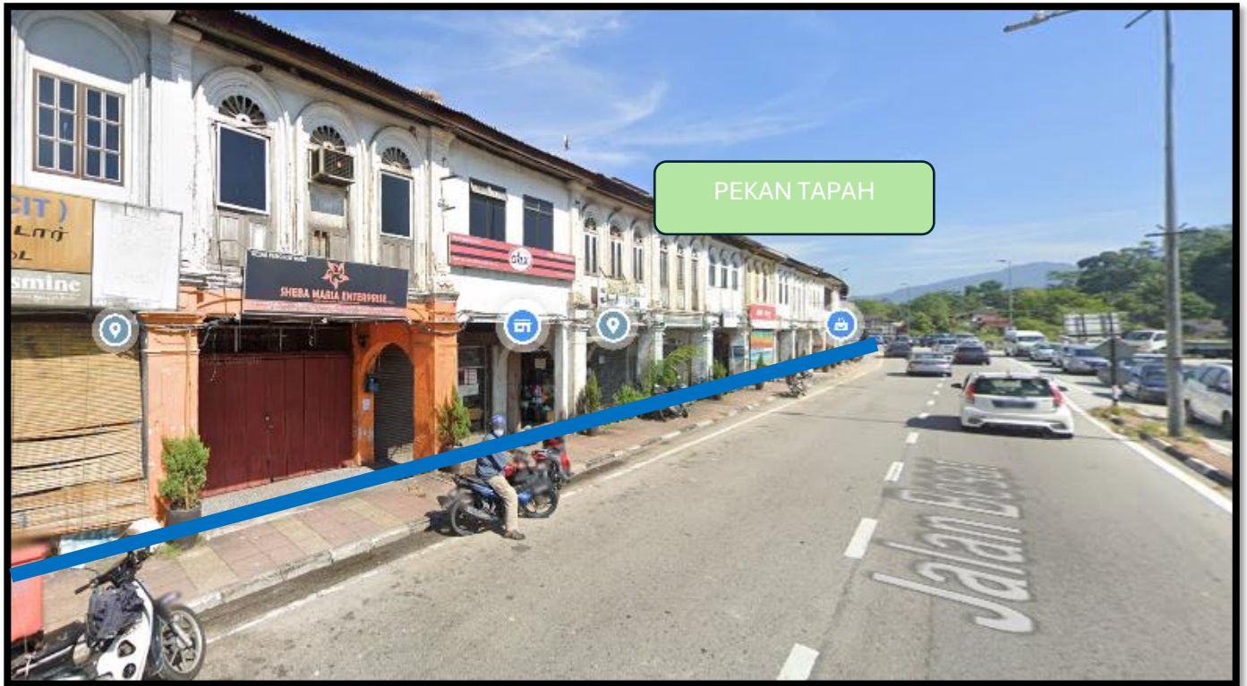
FIGURE 1.9: JALAN IPOH – KUALA LUMPUR (1)