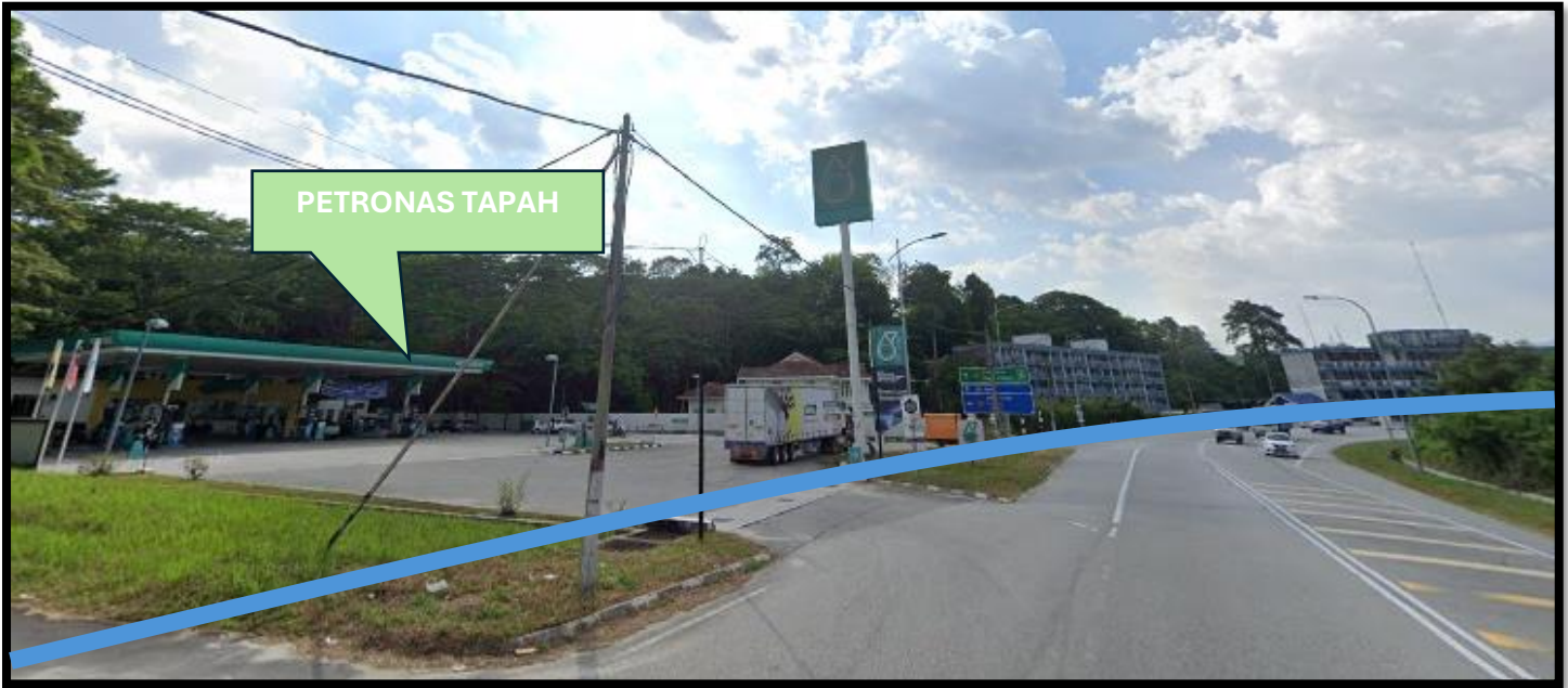
FIGURE 1.7: JALAN IPOH – KUALA LUMPUR (1)