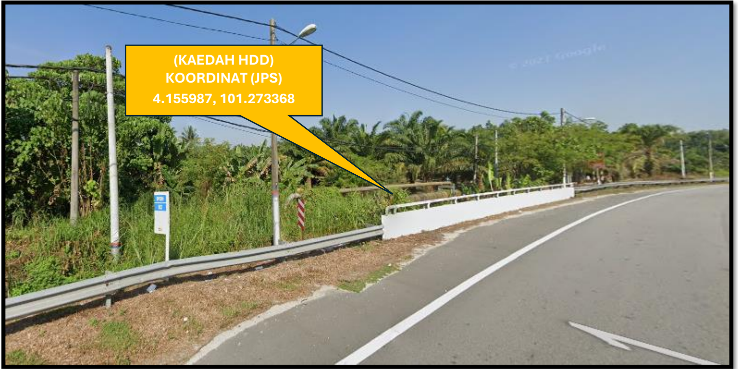
FIGURE 1.3: SUNGAI MERBAU