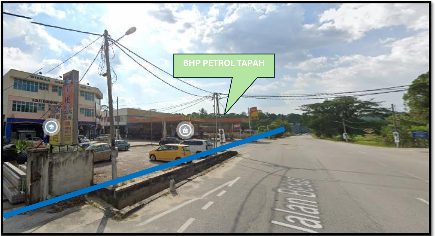
FIGURE 1.6: JALAN IPOH – KUALA LUMPUR (1)