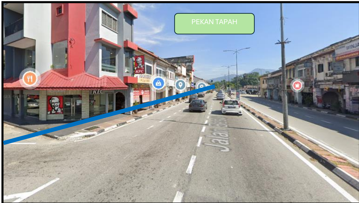
FIGURE 1.10: JALAN IPOH – KUALA LUMPUR (1)