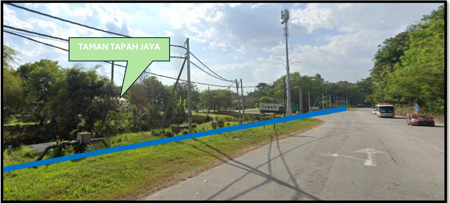
FIGURE 1.5: JALAN IPOH – KUALA LUMPUR (1)