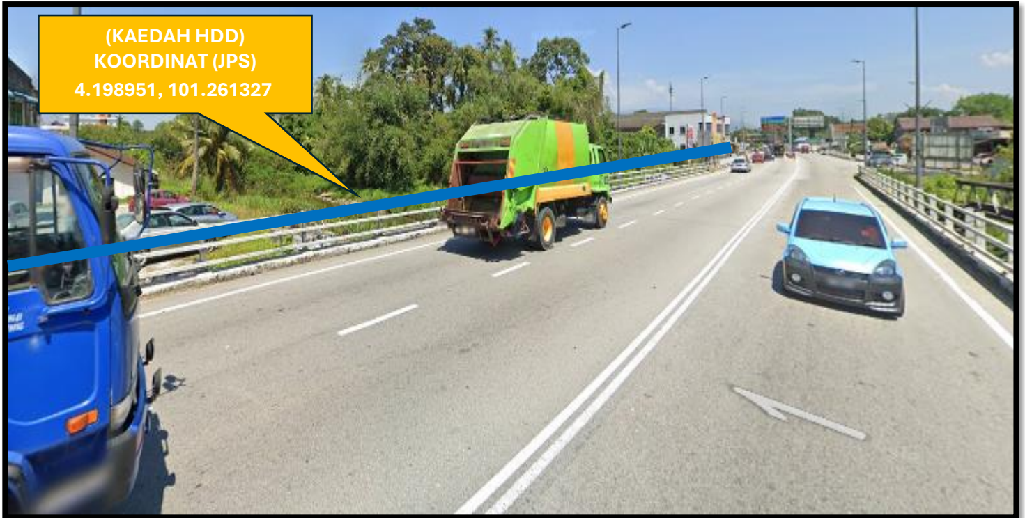
FIGURE 1.11: SUNGAI BATANG PADANG