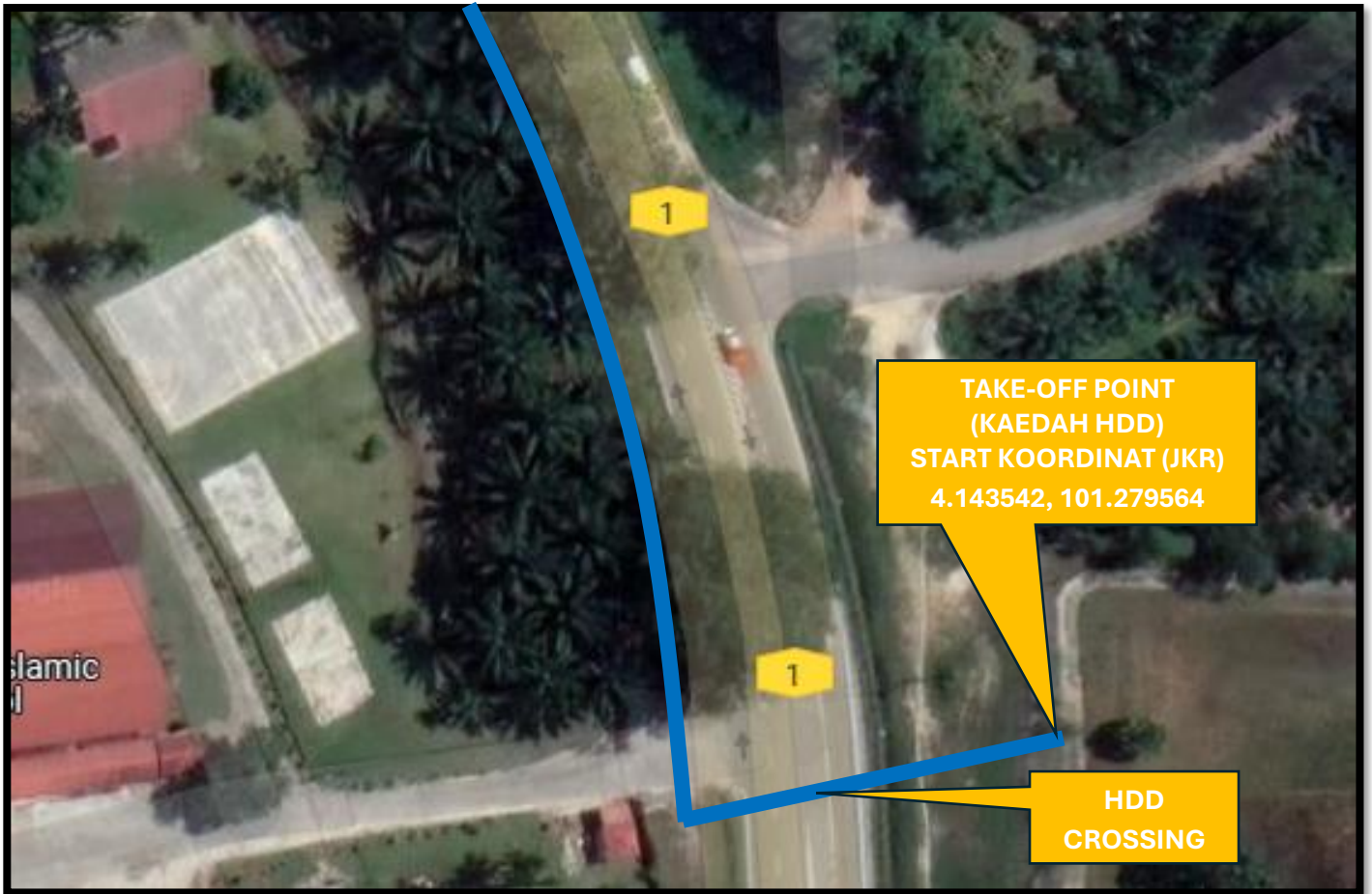
FIGURE 1.1: JALAN IPOH – KUALA LUMPUR (1)