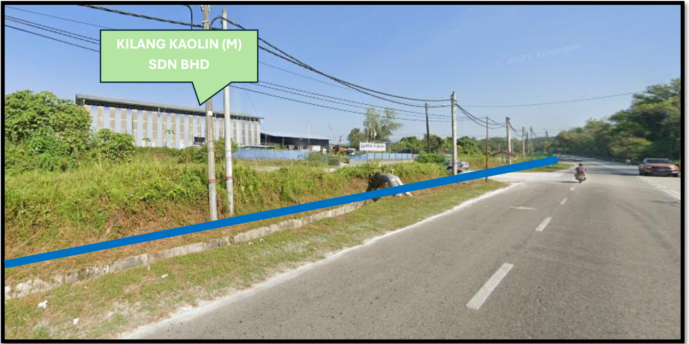
FIGURE 1.4: JALAN IPOH – KUALA LUMPUR (1)