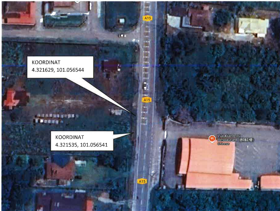
CADANGAN PEMASANGAN PRV SAIZ 150MM.