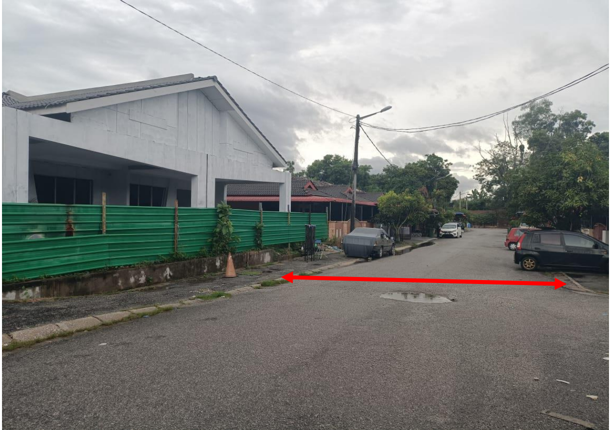
( JALAN GERBANG TANJUNG 7 )