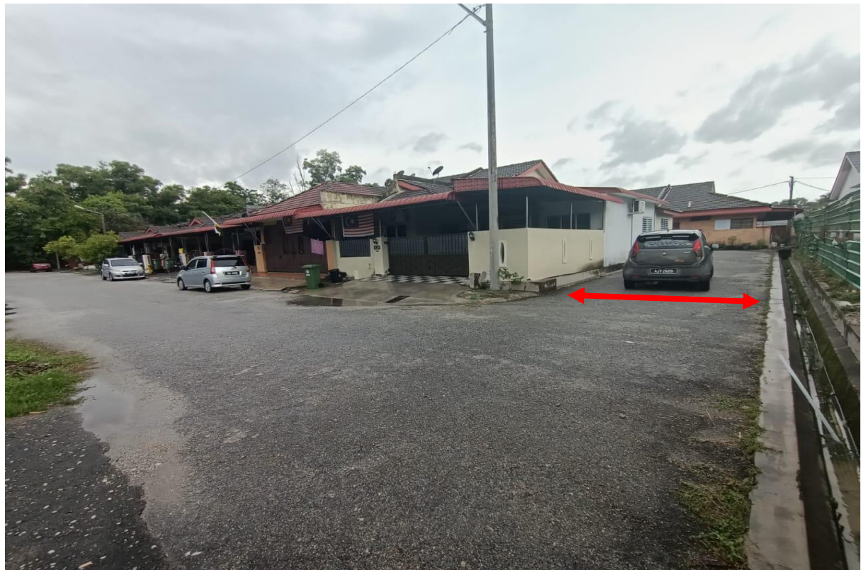
( JALAN GERBANG TANJUNG 8 )