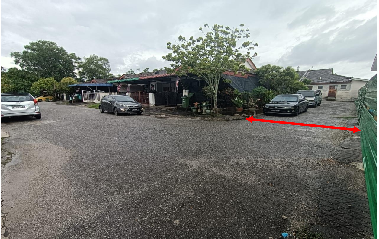
( JALAN GERBANG TANJUNG 9 )