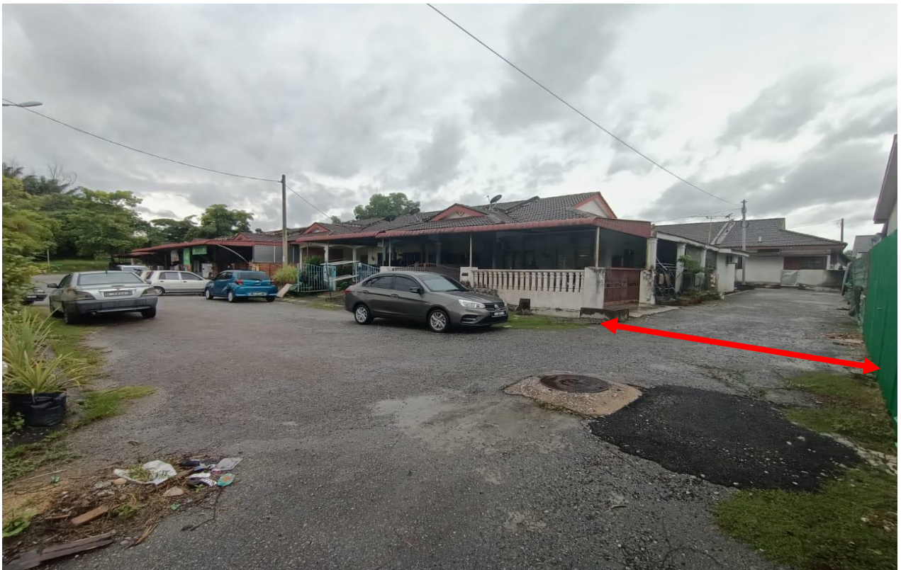
( JALAN GERBANG TANJUNG 10 )