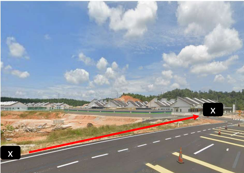
Manhole 5-6 – JRC7