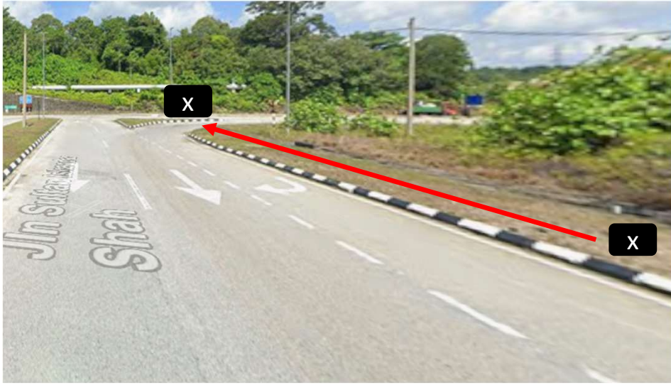
Manhole 3-4 – JRC7