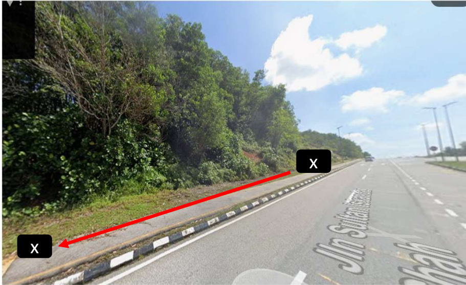
Manhole 1-2 – JRC7