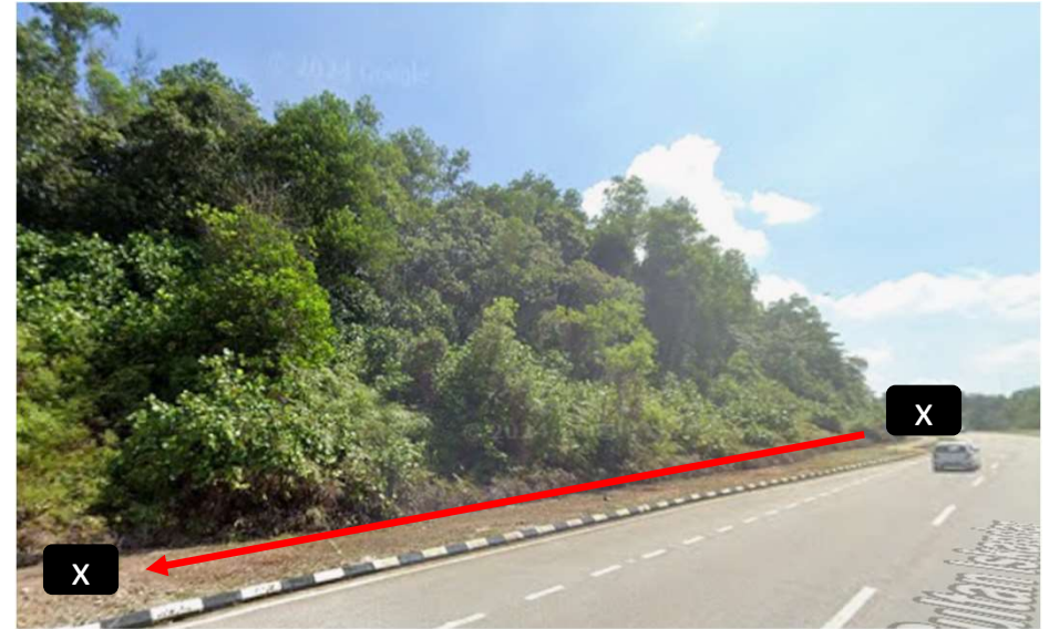
Manhole 2-3 – JRC7