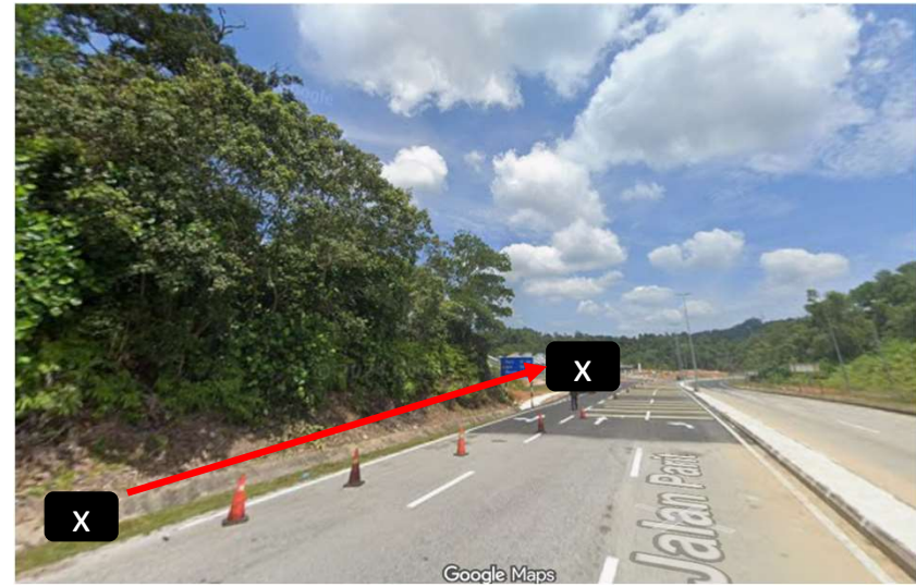
Manhole 4-5 – JRC7