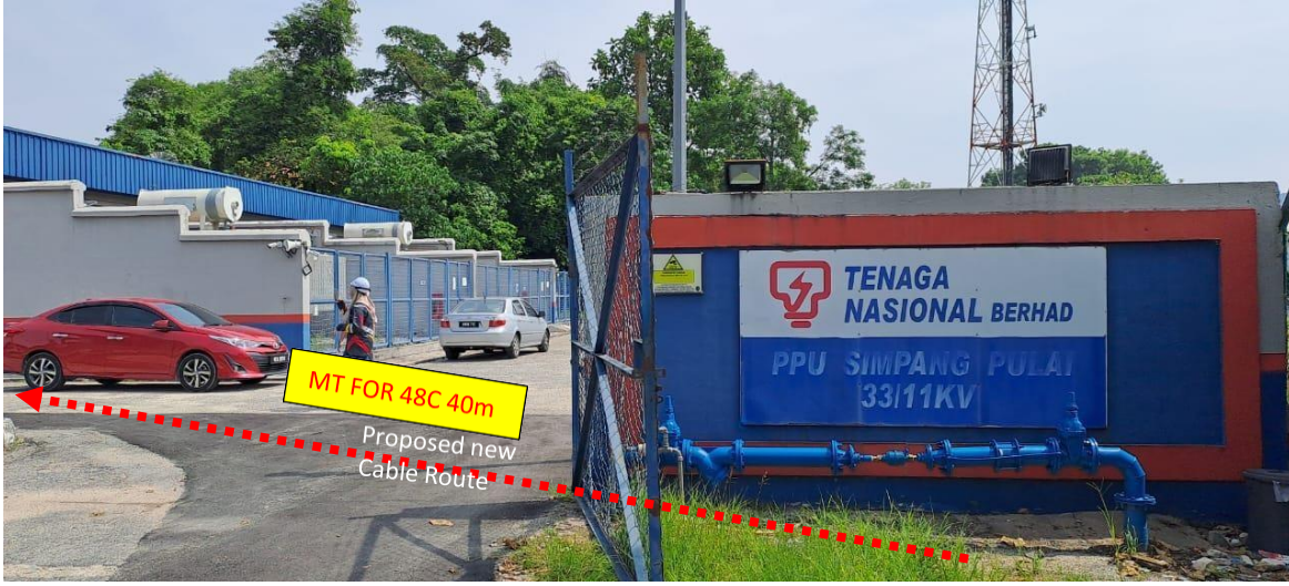
PMU SIMPANG PULAI