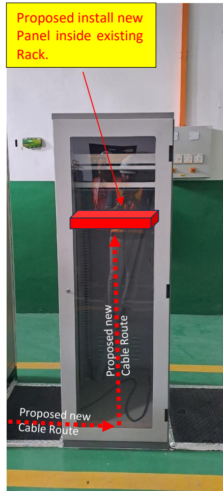
PROPOSED EQUIPMENT LKOCATION