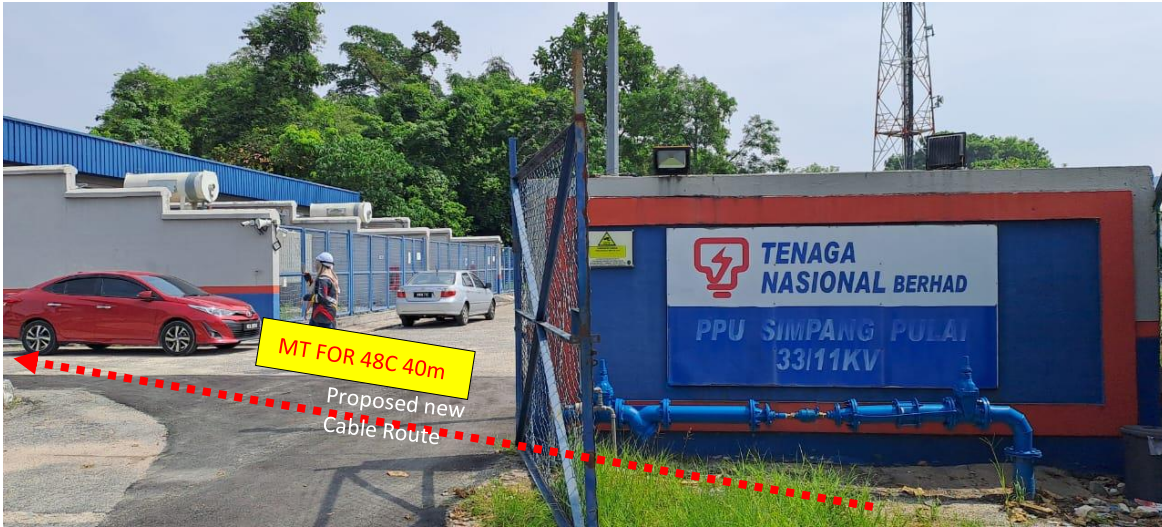
PMU SIMPANG PULAI