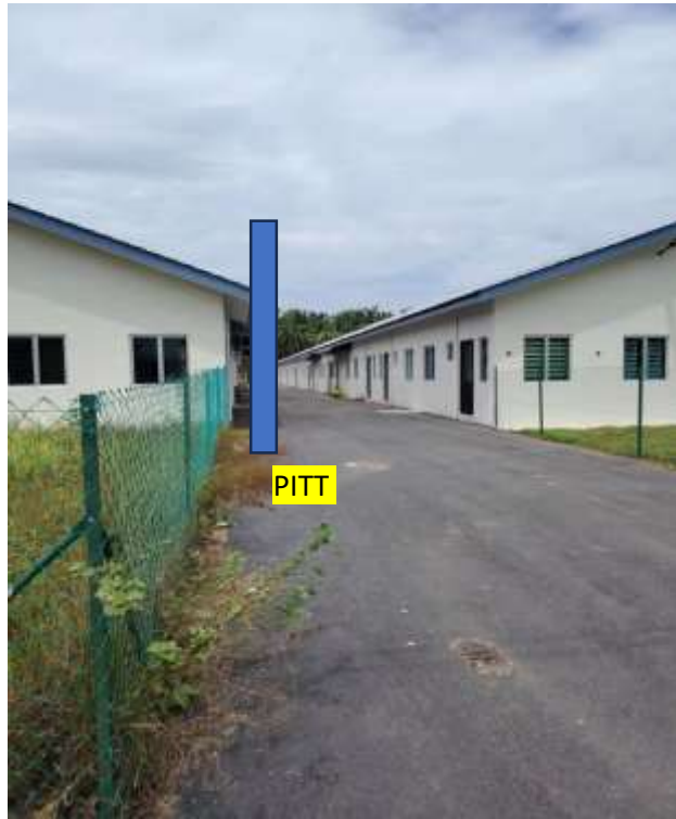
Concrete Pole 6 - 10