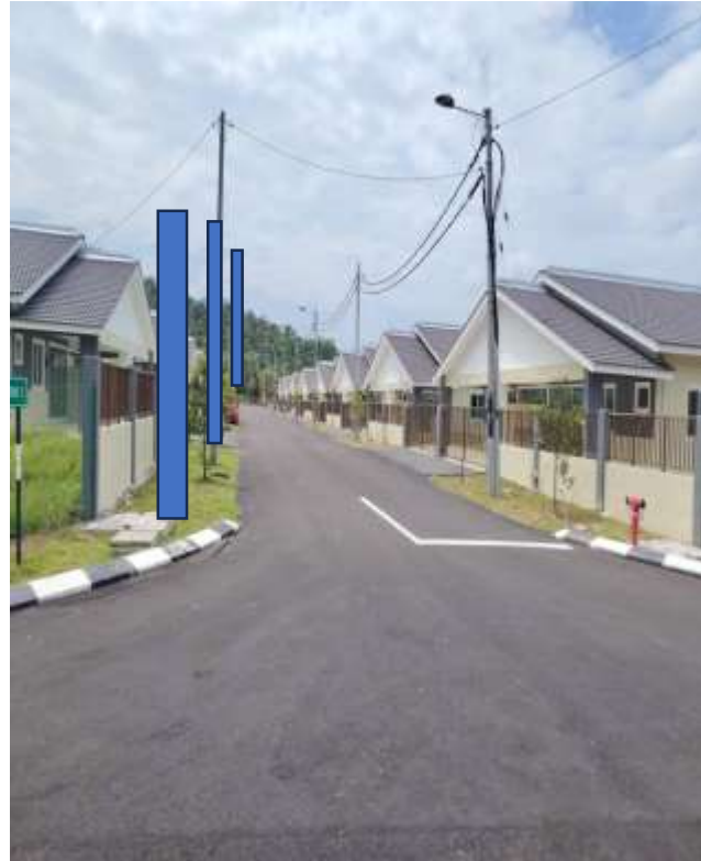
Concrete Pole 13 - 18