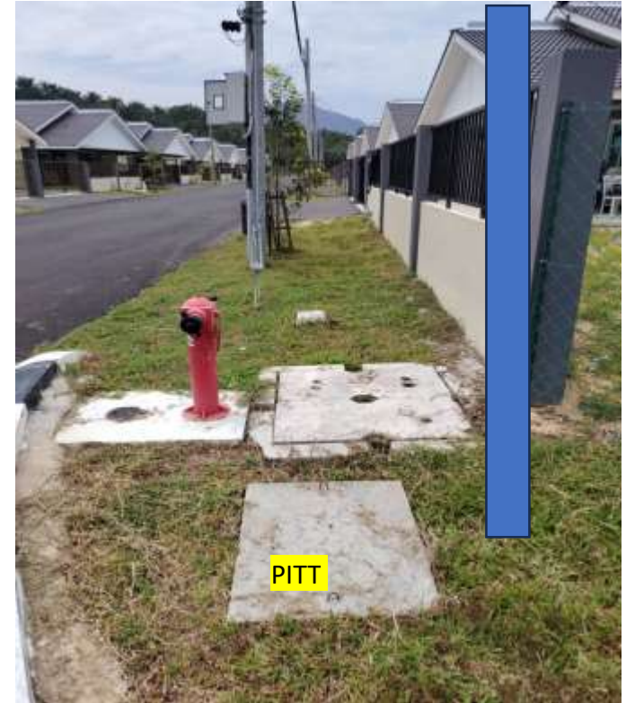
Pole 19 – Pole 26