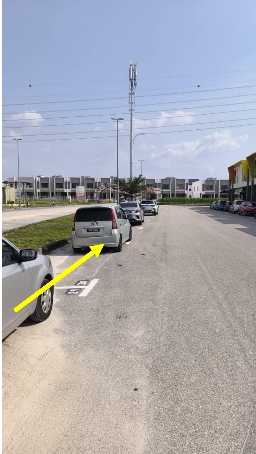
Proposed 1ft width of open cut for TM works at Lapangan Perdana 10