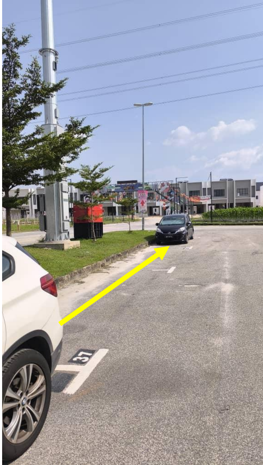
Proposed 1ft width of open cut for TM works at Lapangan Perdana 10