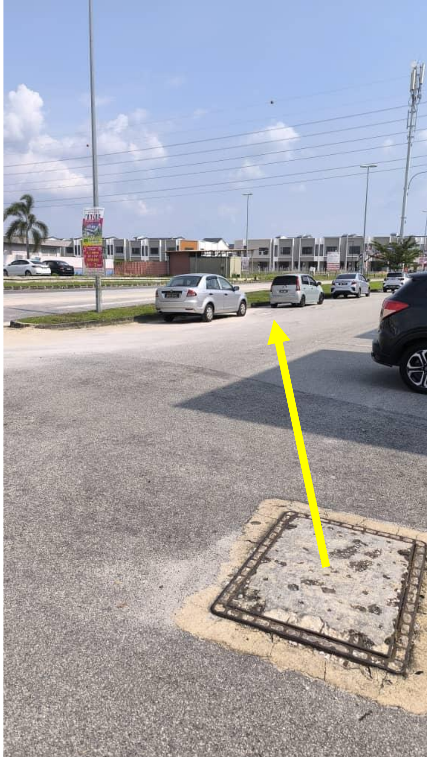
Proposed 1ft width of open cut for TM works at Lapangan Perdana 10