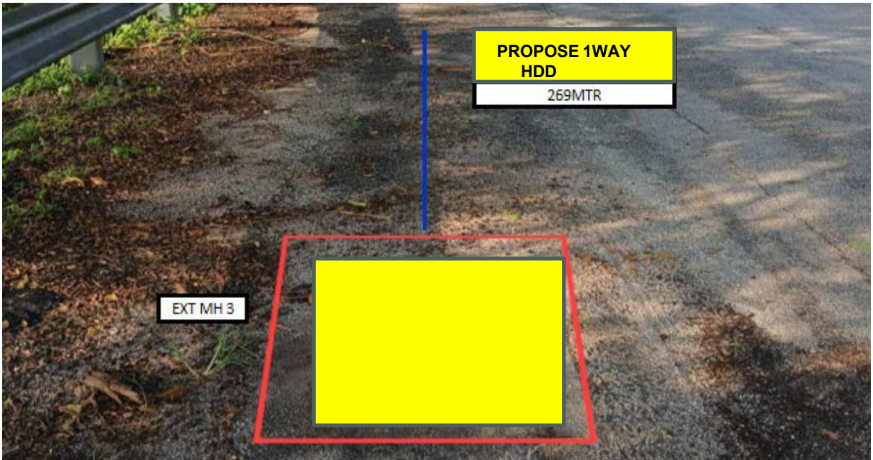
LOCATION AT IPOH - LUMUTHWY