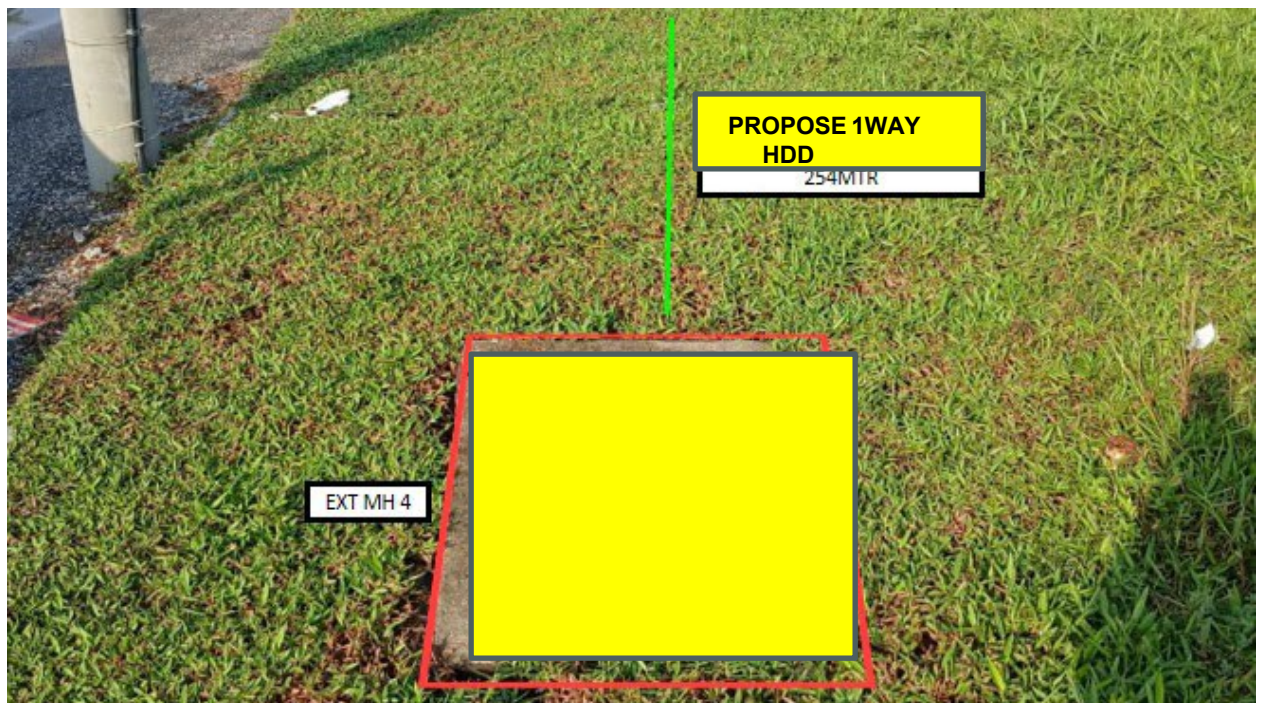
LOCATION AT IPOH - LUMUTHWY