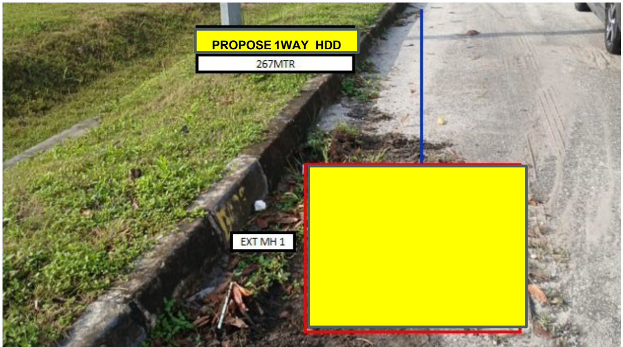
LOCATION AT IPOH-LUMUTHWY