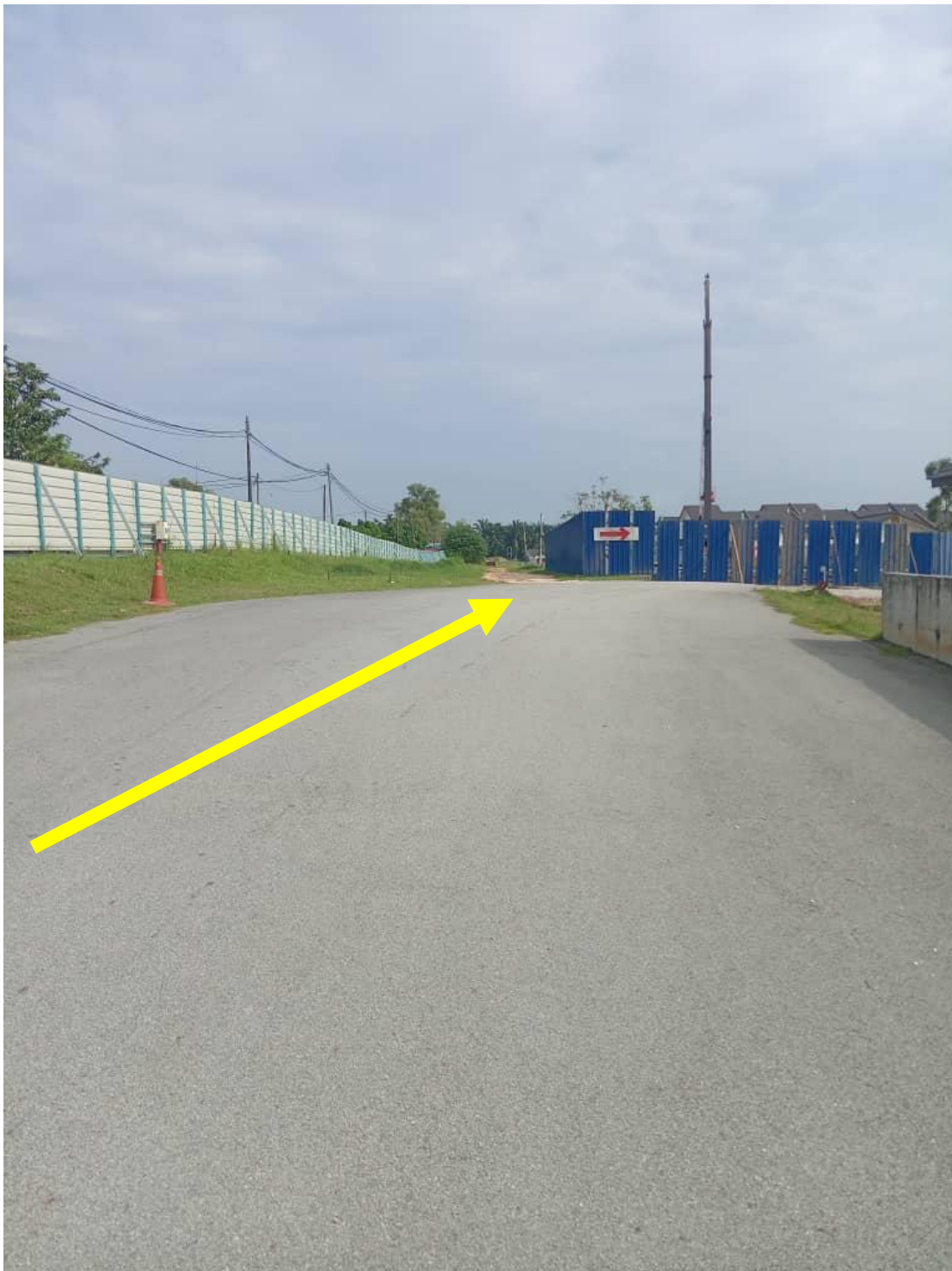
Road cutting for LAP works Proposed open cut (Persiaran Permata)