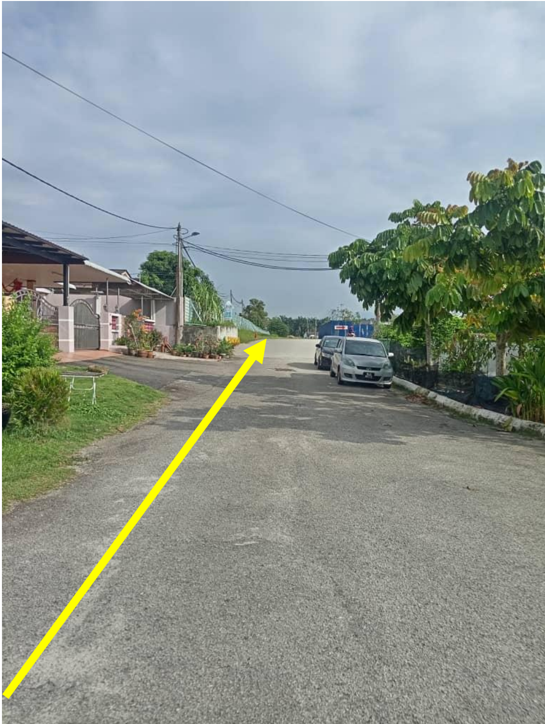
Road cutting for LAP works Proposed open cut (Persiaran Permata)