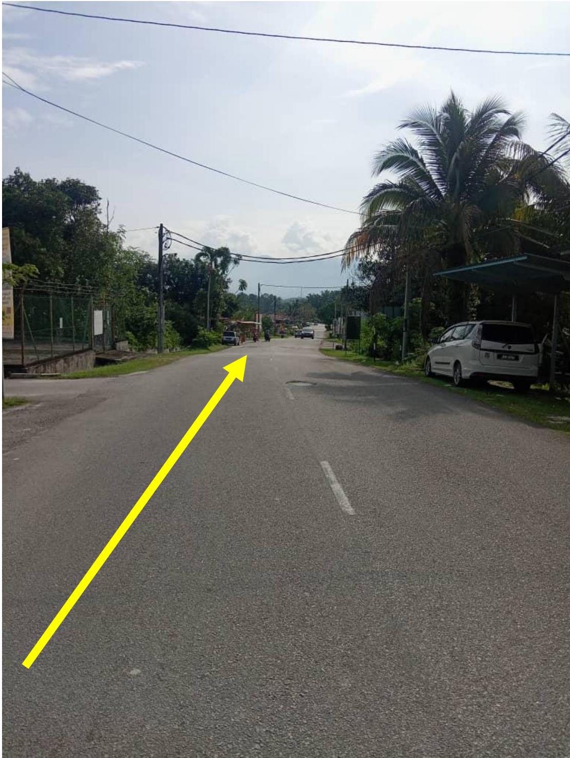
Road cutting for LAP works Proposed open cut (Persiaran Permata)