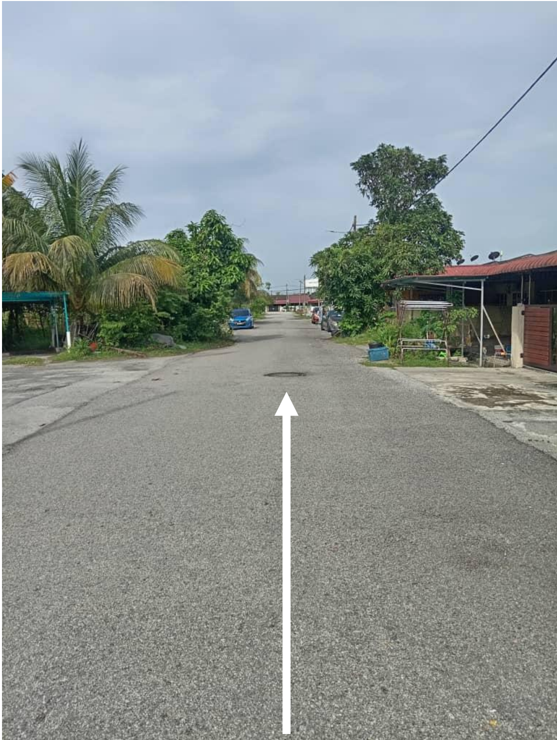
Road cutting for sewerline works

Proposed open cut at middle of road (Jalan Permai 11)