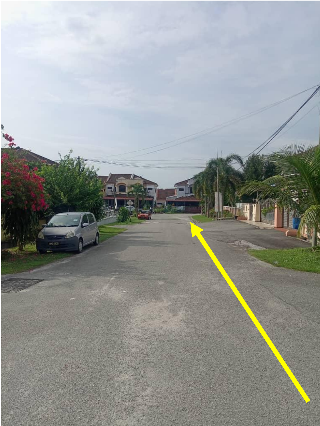
Road cutting for LAP works Proposed open cut (Persiaran Permata)