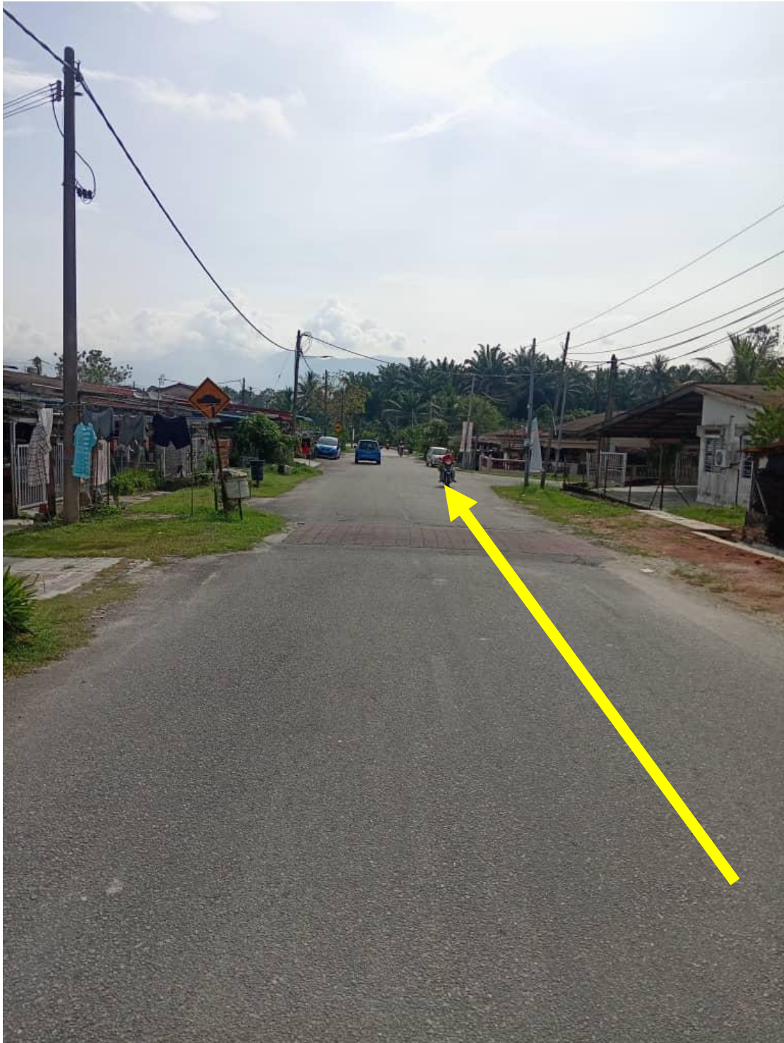
Road cutting for LAP works Proposed open cut (Persiaran Permata)