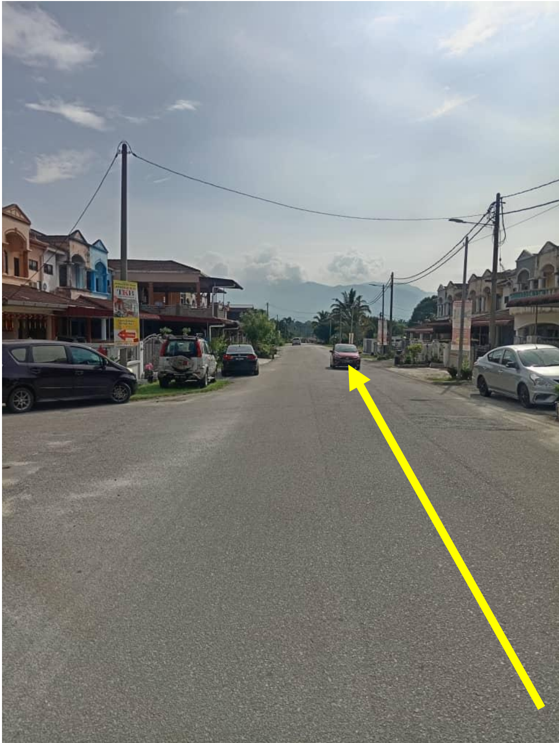
Road cutting for LAP works Proposed open cut (Persiaran Permata)