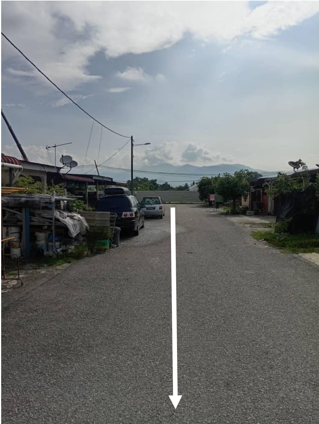
Road cutting for sewerline works

Proposed open cut at middle of road (Jalan Permai 11)