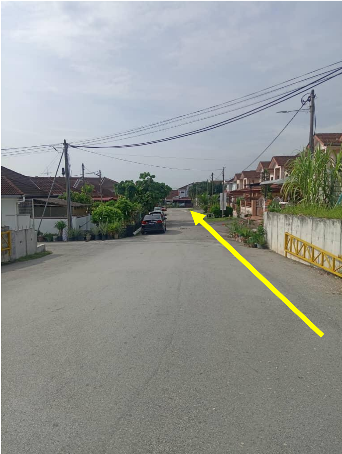
Road cutting for LAP works Proposed open cut (Persiaran Permata)