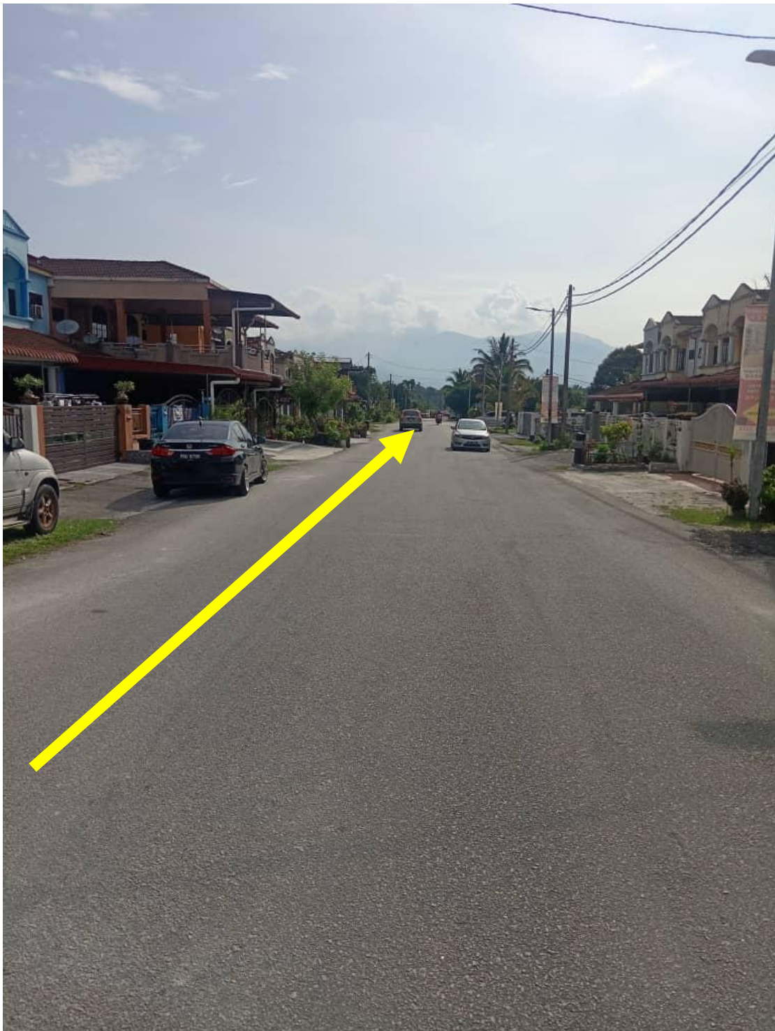
Road cutting for LAP works Proposed open cut (Persiaran Permata)