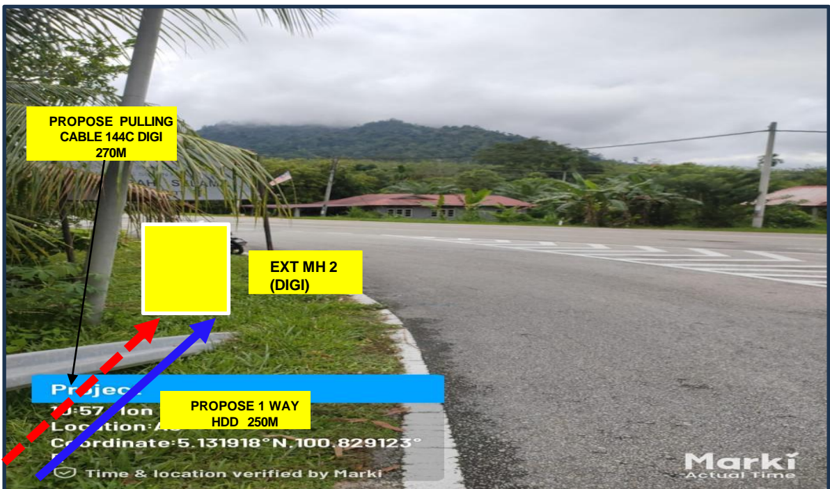
Jalan A39 Kampung Banggol Kolum