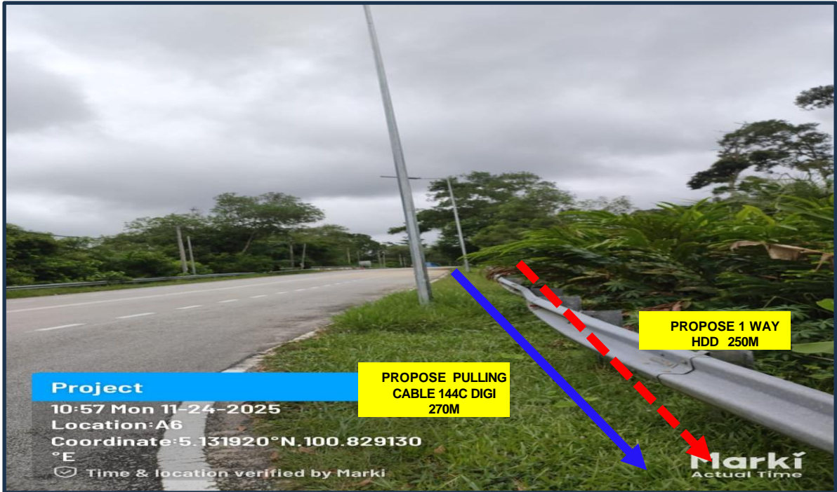
Jalan A39 Kampung Banggol Kolum