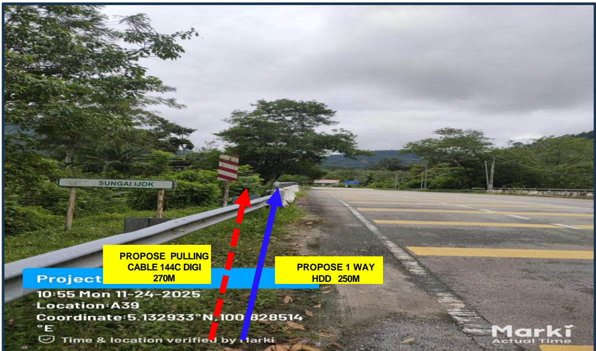
Jalan A39 Kampung Banggol Kolam