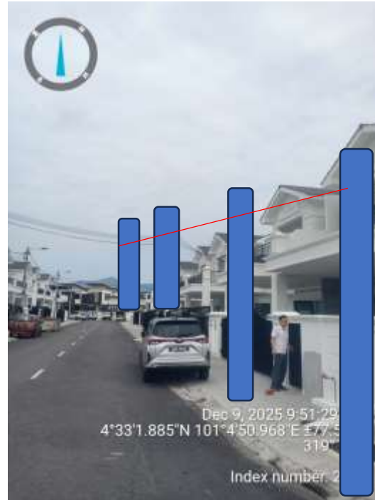
PINGGIRAN PENGKALAN 3