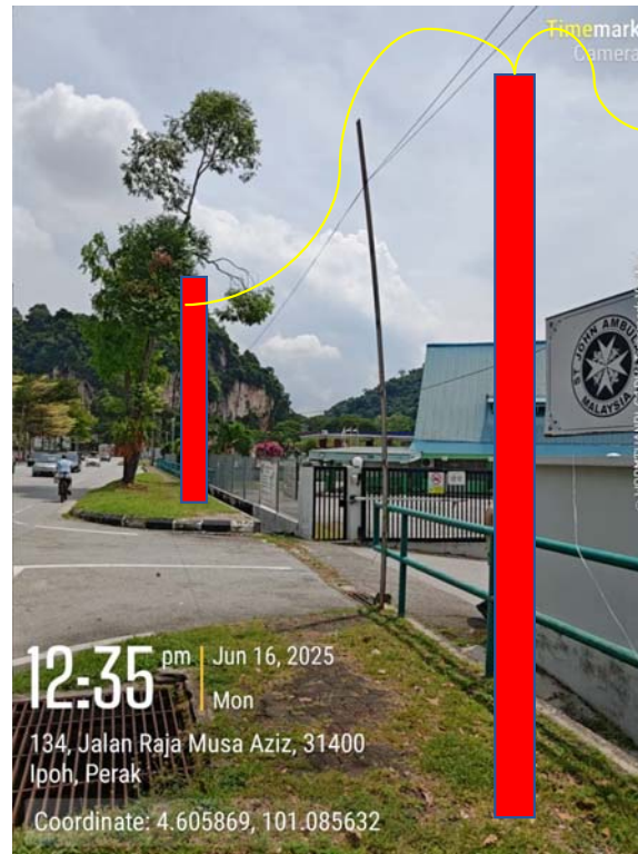
Pole 5 dan pole 6