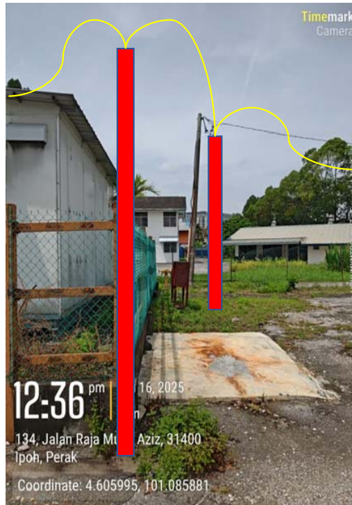
Pole 2 and pole 3