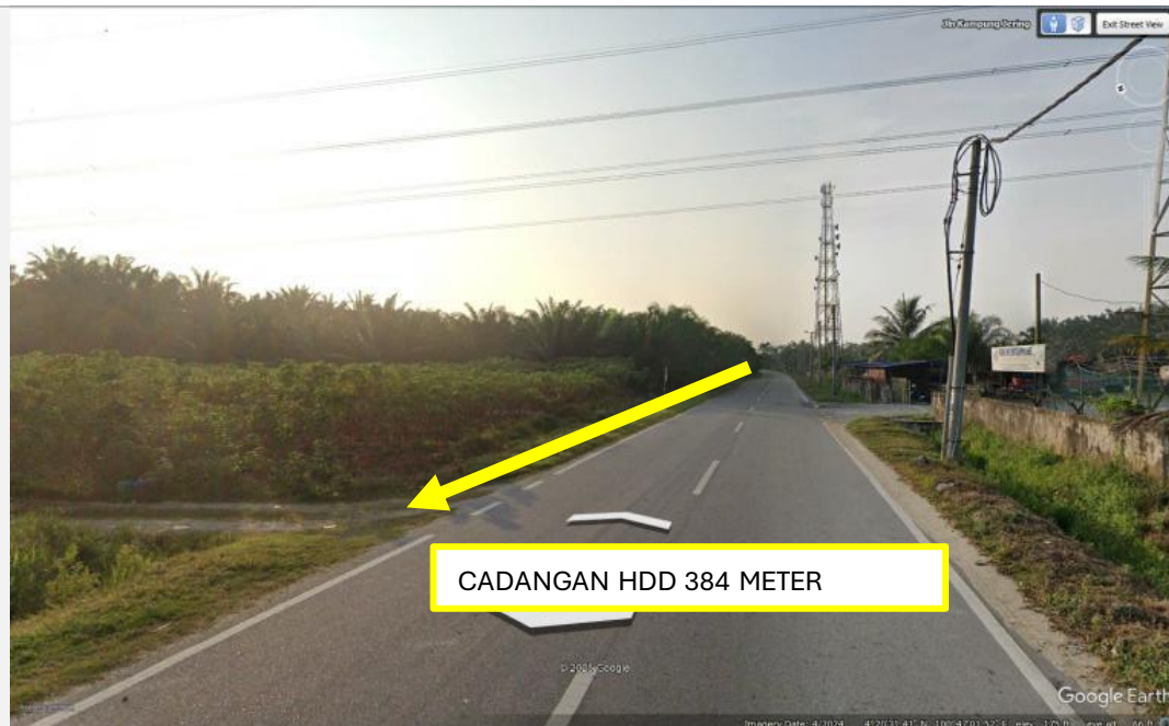
GAMBAR 6 : KAWASAN KERJA MELIBATKAN HORIZONTAL DIRECTIONAL DRILLING (HDD)