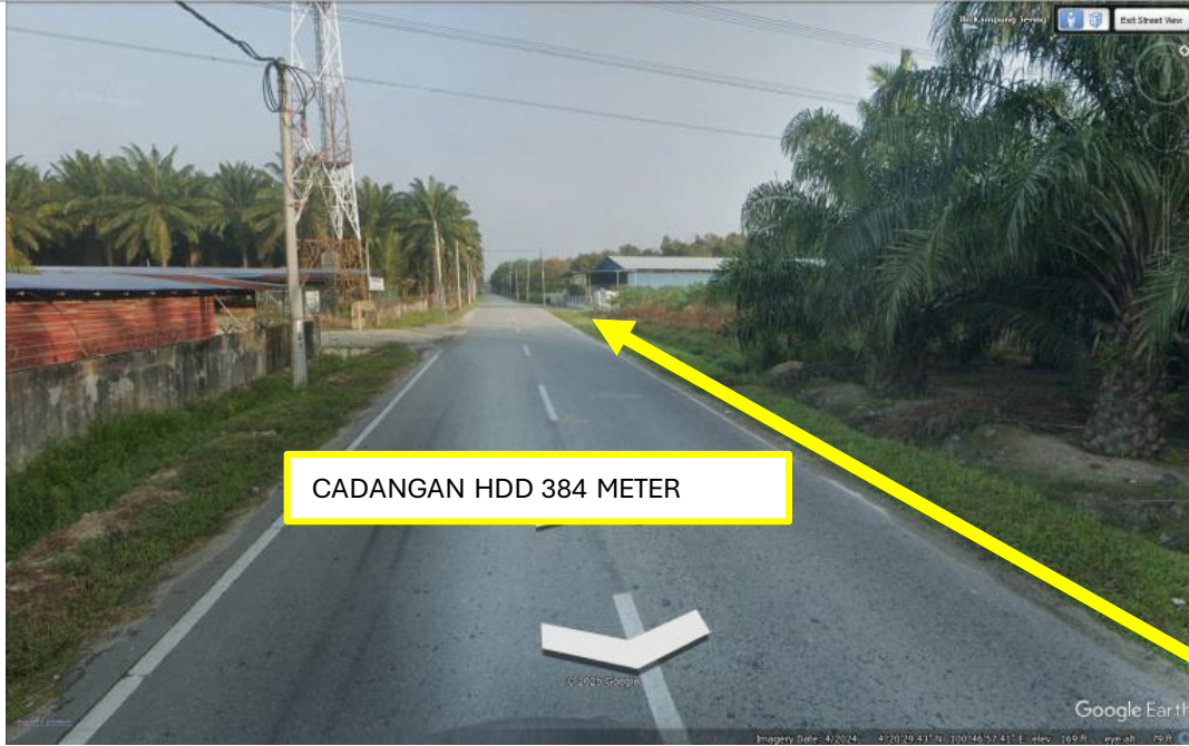
GAMBAR 5 : KAWASAN KERJA MELIBATKAN HORIZONTAL DIRECTIONAL DRILLING (HDD)