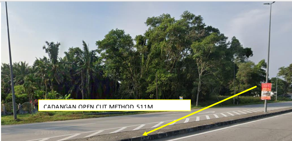
GAMBAR 2 : KAWASAN KERJA MELIBATKAN OPEN CUT METHOD AT THE GRASS VERGE