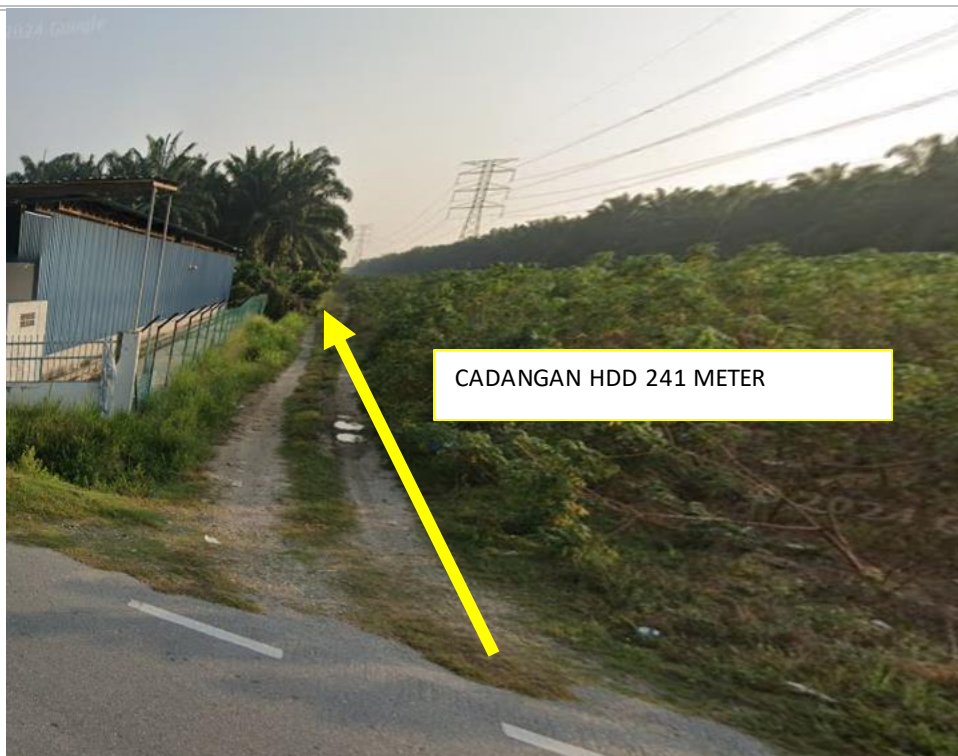
GAMBAR 7 : KAWASAN KERJA MELIBATKAN HORIZONTAL DIRECTIONAL DRILLING (HDD)