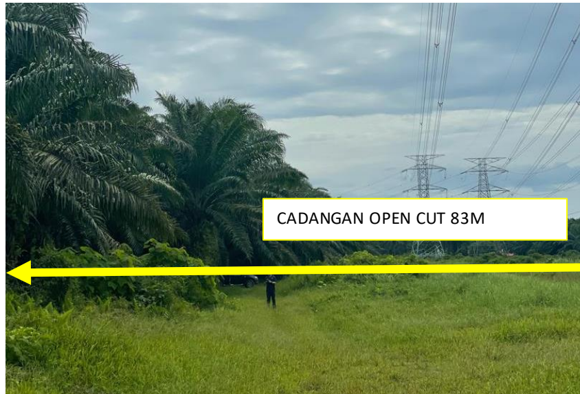
GAMBAR 1 : KAWASAN KERJA MELIBATKAN OPEN CUT METHOD AT THE GRASS VERGE