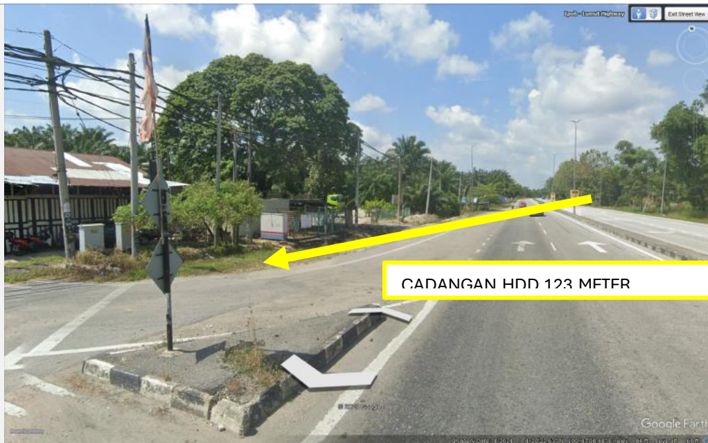
GAMBAR 4 : KAWASAN KERJA MELIBATKAN HORIZONTAL DIRECTIONAL DRILLING (HDD)