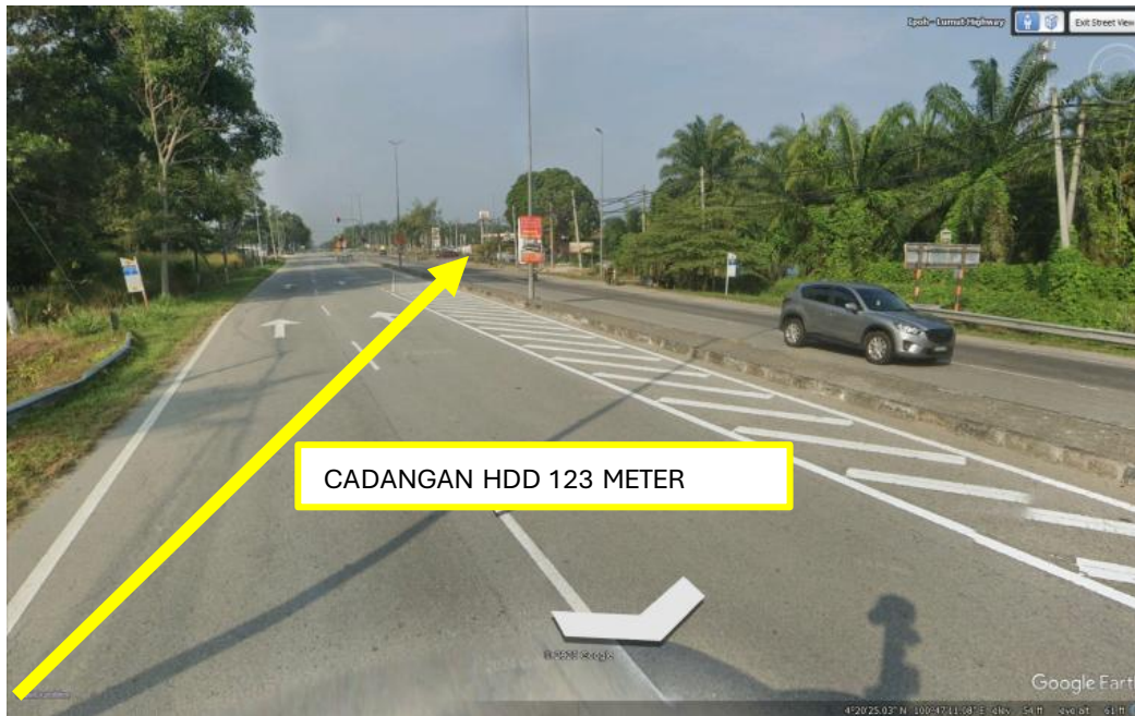
GAMBAR 3 : KAWASAN KERJA MELIBATKAN HORIZONTAL DIRECTIONAL DRILLING (HDD)