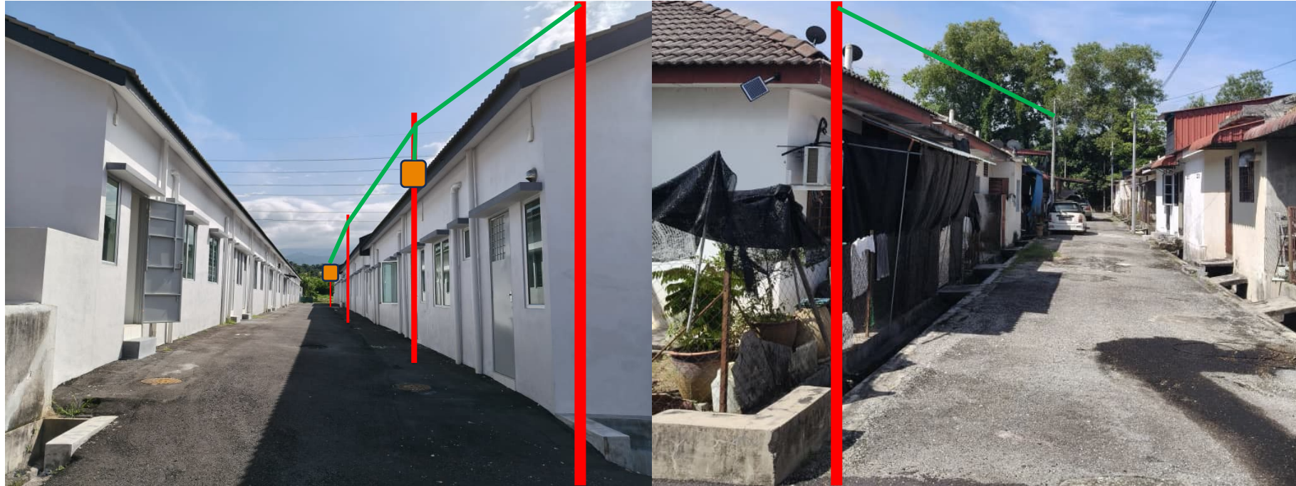
Jalan Gerbang Tanjung 10