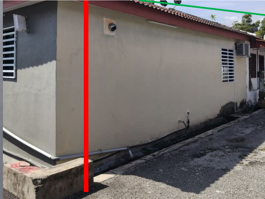
Jalan Gerbang Tanjung 8