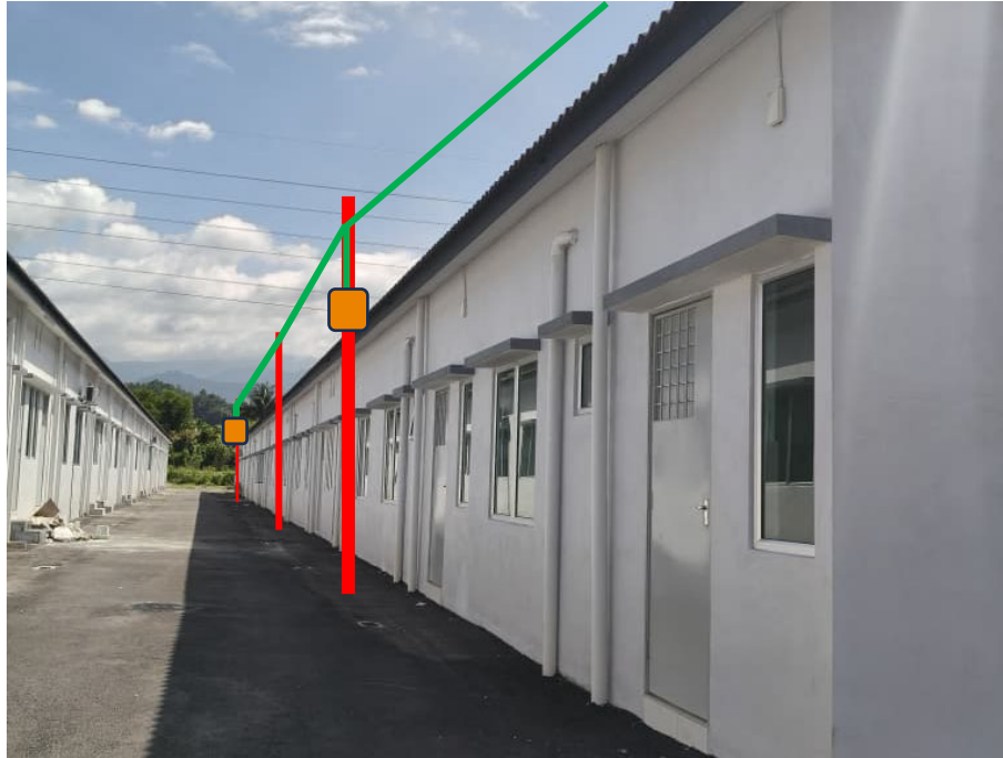
Jalan Gerbang Tanjung 9