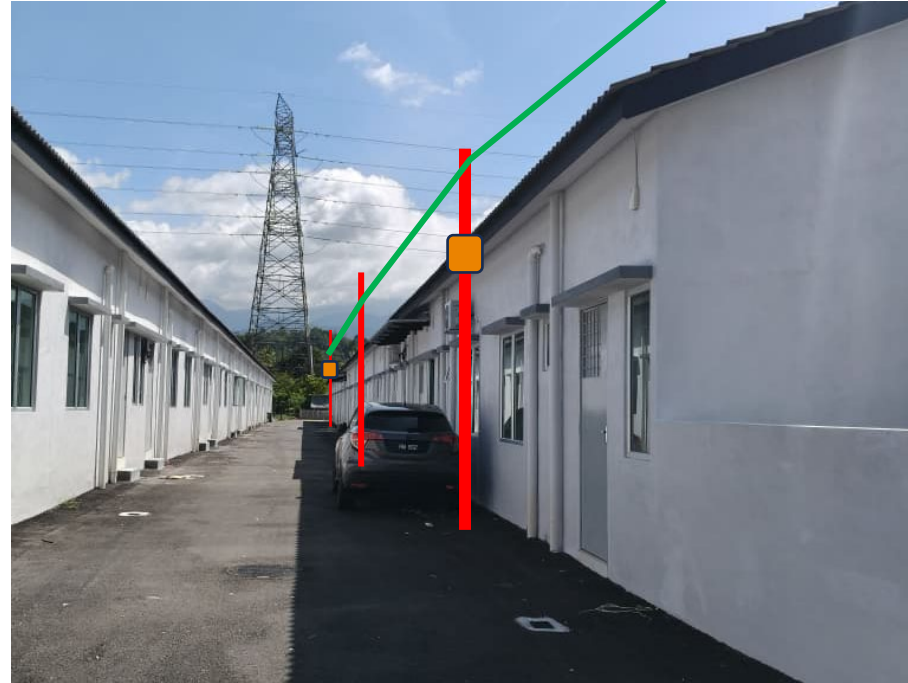
Jalan Gerbang Tanjung 8