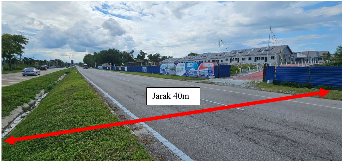
JALAN BEMBAN (Side View)