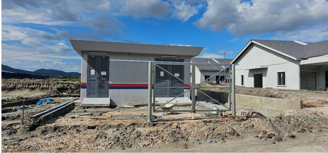
TAPAK CADANGAN GAJ 0267

Our Ref. : C128/KUDR/25/01 Date : 28 Feb 2025