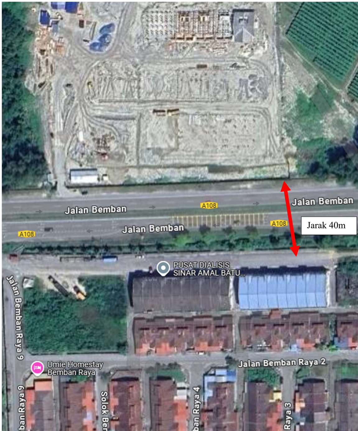
Google Site Plan