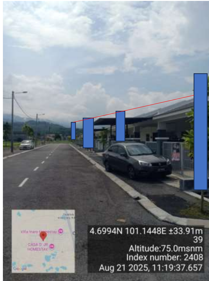
Concrete Pole 9 - 12