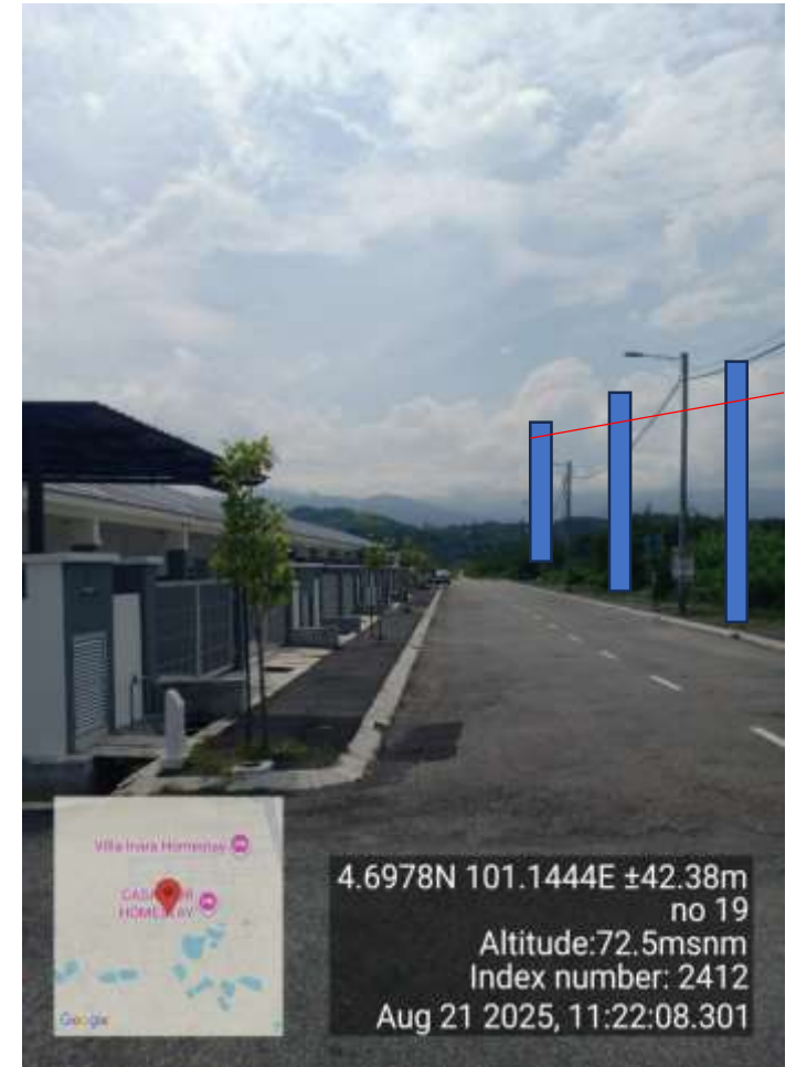
Pole 14– Pole 16